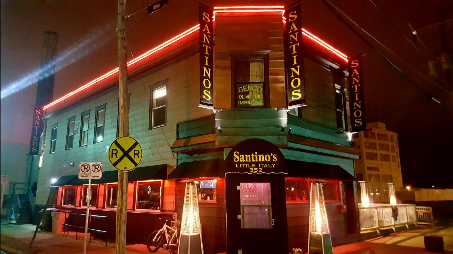
File No. 161161. Updated Facade.