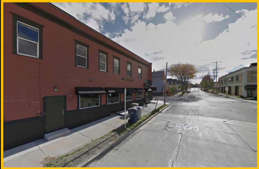
View from South Hilbert Street, looking southeast