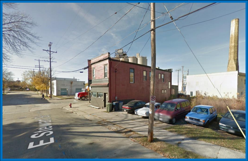
View from East Stewart Street, looking northwest