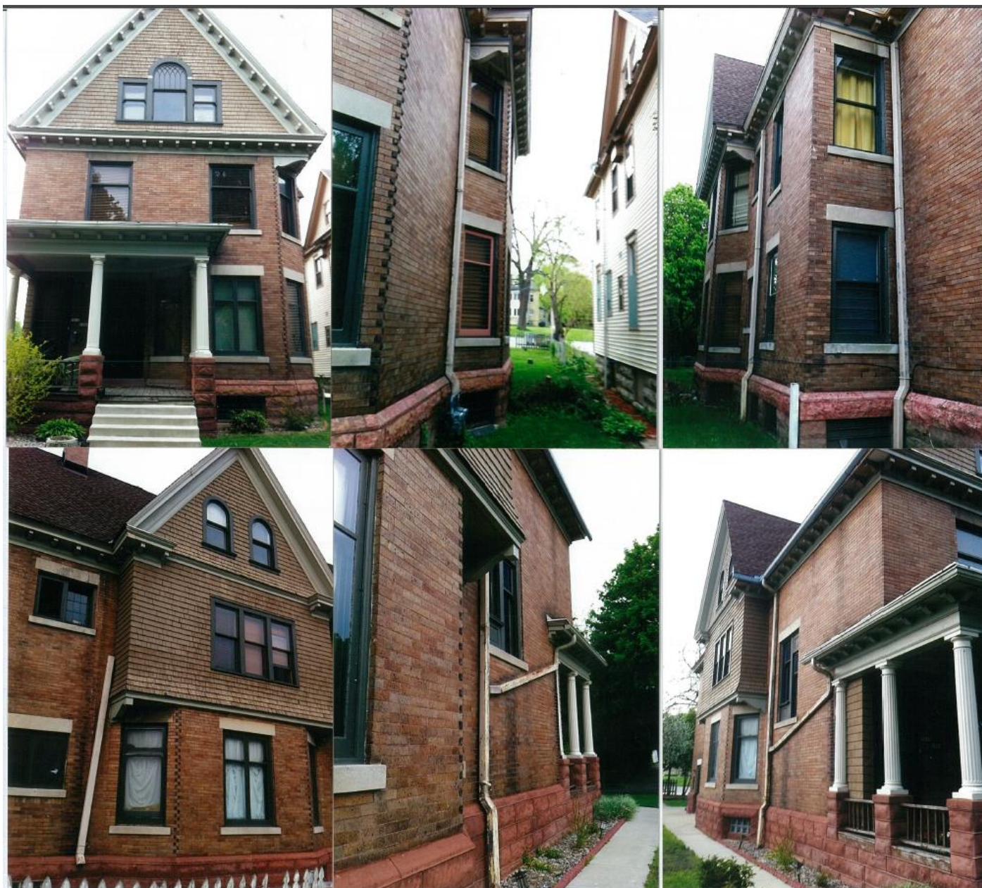
Application photos dated June 2011 indicating state of gutters and downspouts at time of application