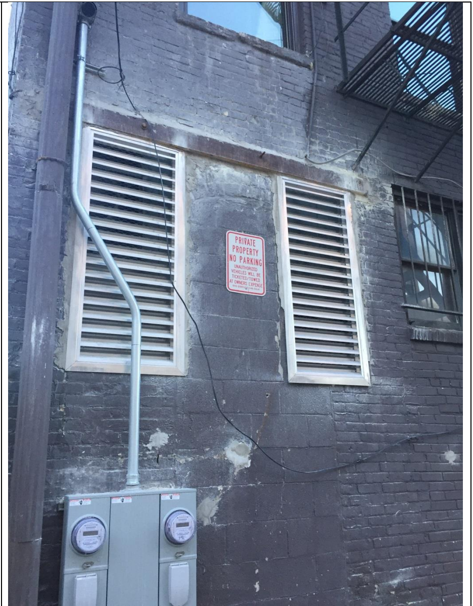
Present Conditions with unapproved work. Bare metal vents and electrical service are to be painted to match the surrounding brick.