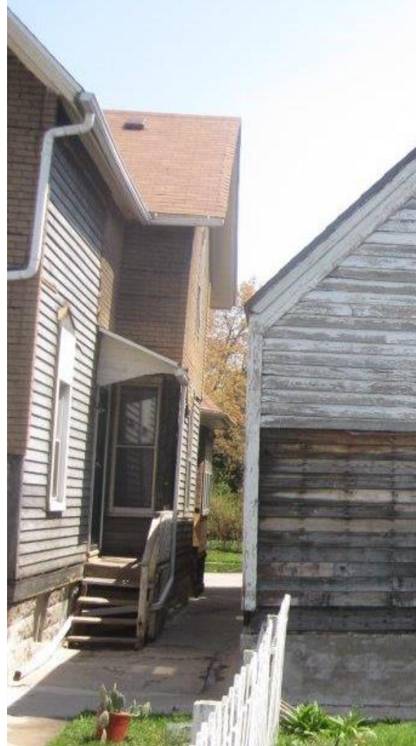
Approximate current conditions. New 10-foot porch has already been constructed. Porch canopy shown will be removed and its construction details reproduced in new roof.