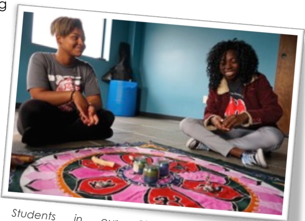
peacekeeping and mediation skills to help peers repair the harm when they make mistakes.

Rather than striving for A's, our students work with staff to become interdependent learners who share their knowledge with the community. This includes personal growth, as our discipline policy incorporates Restorative Justice practices instead of zero-tolerance policies to help us learn from our mistakes. We also spend much of our learning time with the community, and we have collaborated with over 100 businesses, non-profits and government organizations.