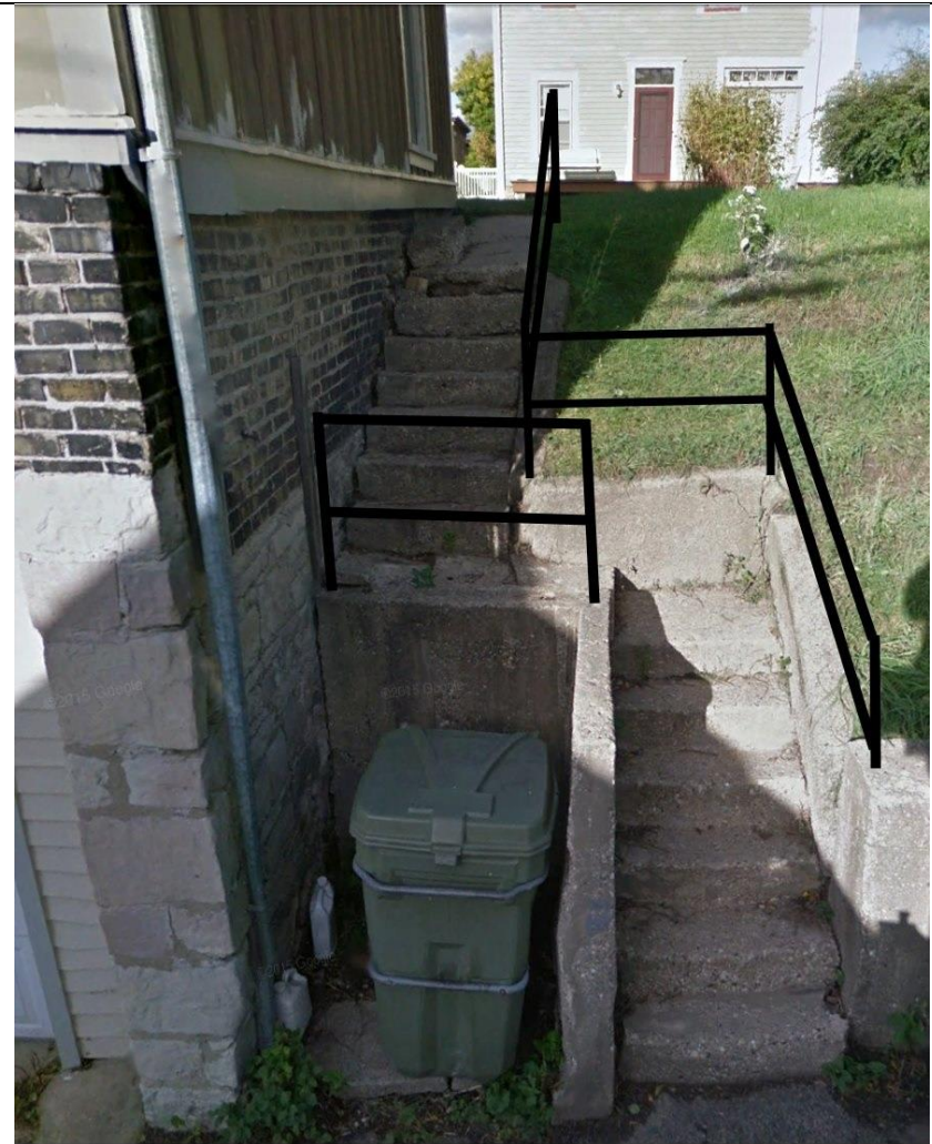
Mockup of installed railing design