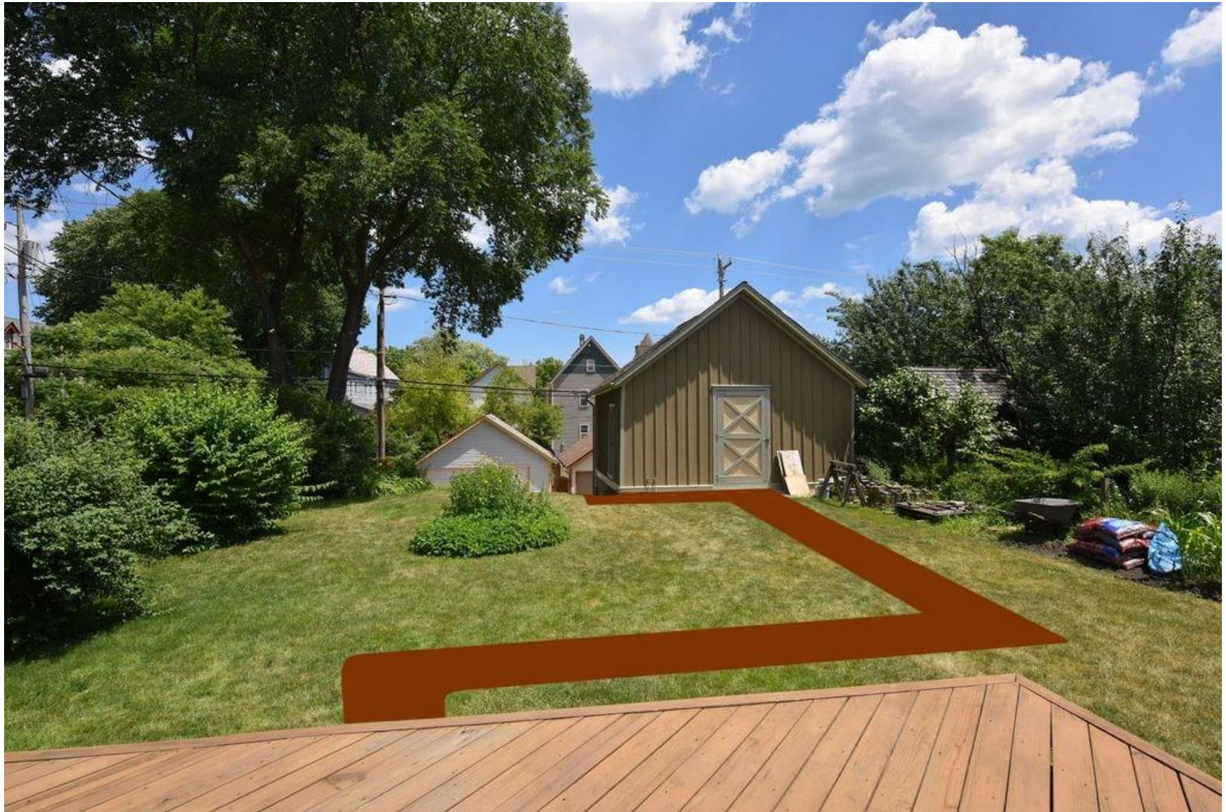
Mockup of installed path. Color is not representative.