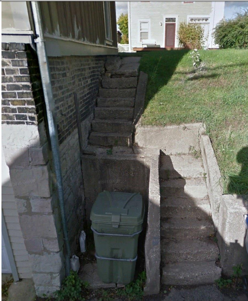
Steps in present condition