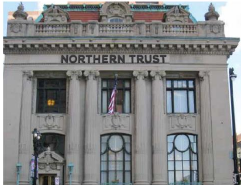
Proposed signage (south elevation) - NTS