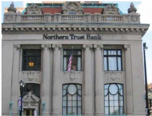
Existing conditions - NTS