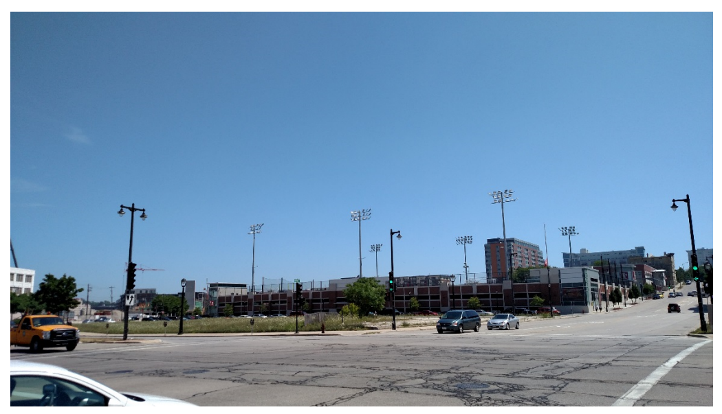
View from SW (Water & Knapp Streets)