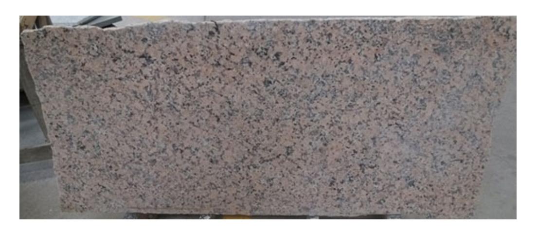
02, 03, 05 Rusticated brick, first floor – machine molded, jumbo oversized (5 courses per 16"), nominal 4" thick, self-supporting veneer on cavity wall, dark color range.

http://pic.stonecontact.com/picture/201510/102677/xili-red-granite-honed-tiles-slabs-nanhua-red-lihua-red-china-red-granites-pearl-flower-red-granite-wall-floor-tiles-wall-floor-tiles-skirting-p384294-1b.jpg