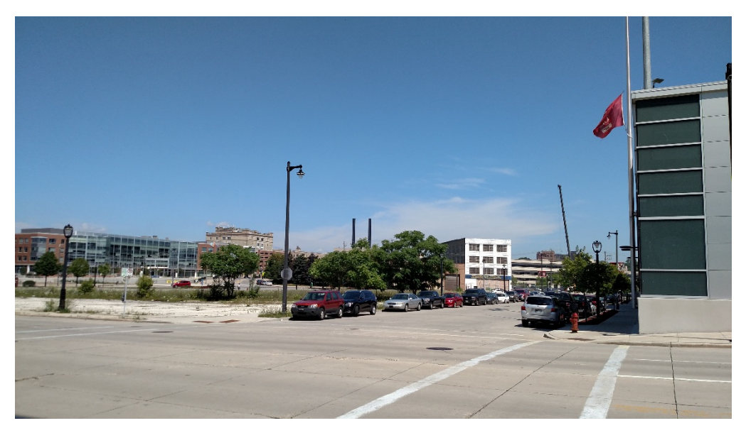
View from SE (Market & Knapp Streets)