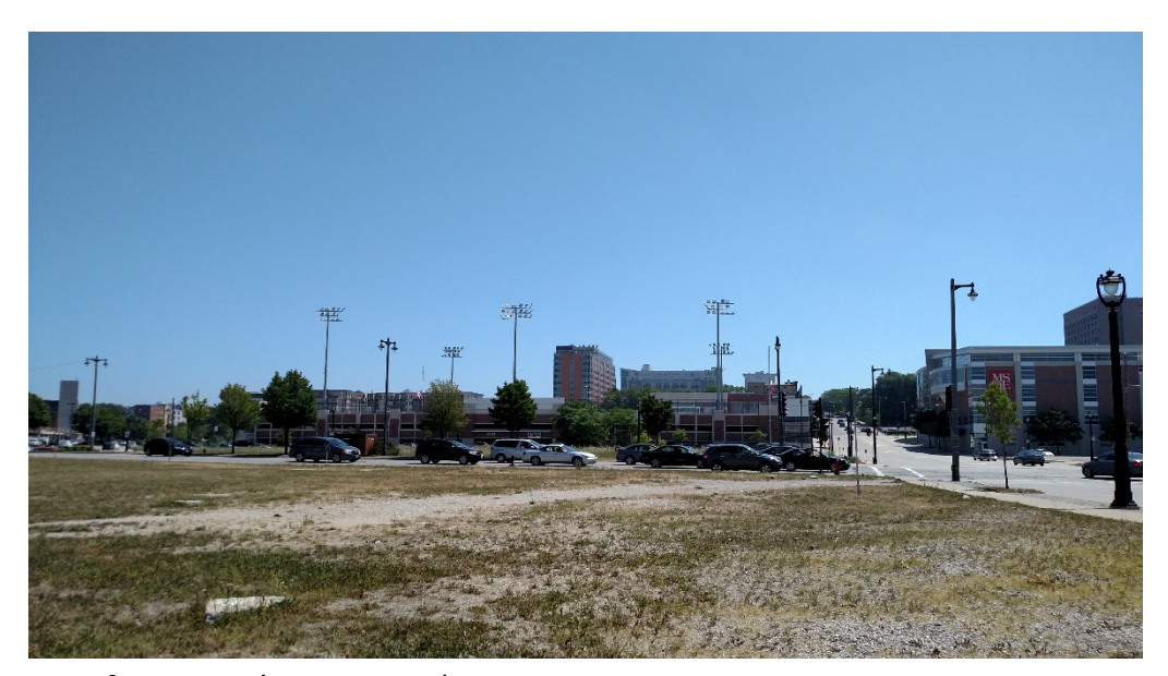
View from West (Water Street)