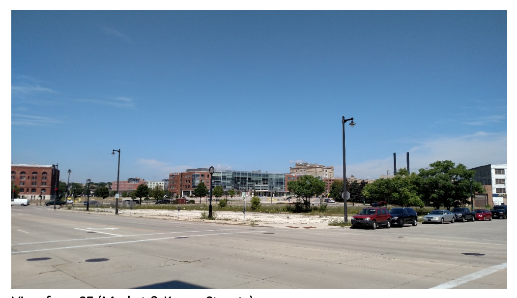
View from SE (Market & Knapp Streets)