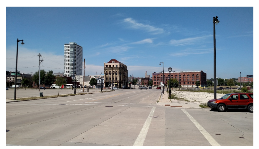
View from East (Market Street)