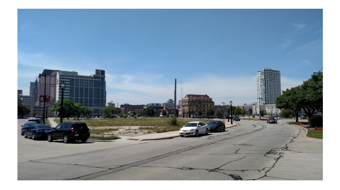
View from NE (Water Street)