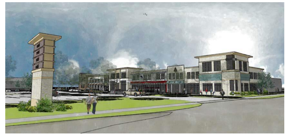
27<sup>th</sup> and Layton | South 27<sup>th</sup> St. Charette