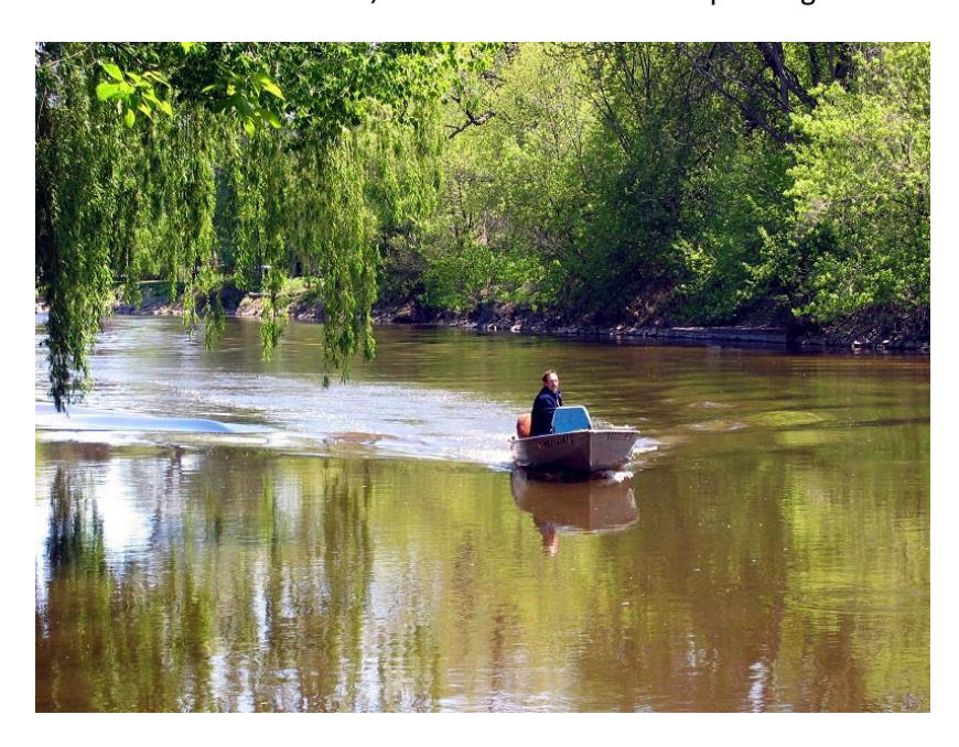
Recreation at the Estabrook Dam Lake Prior to 2008, when the water was deep enough to swim and boat