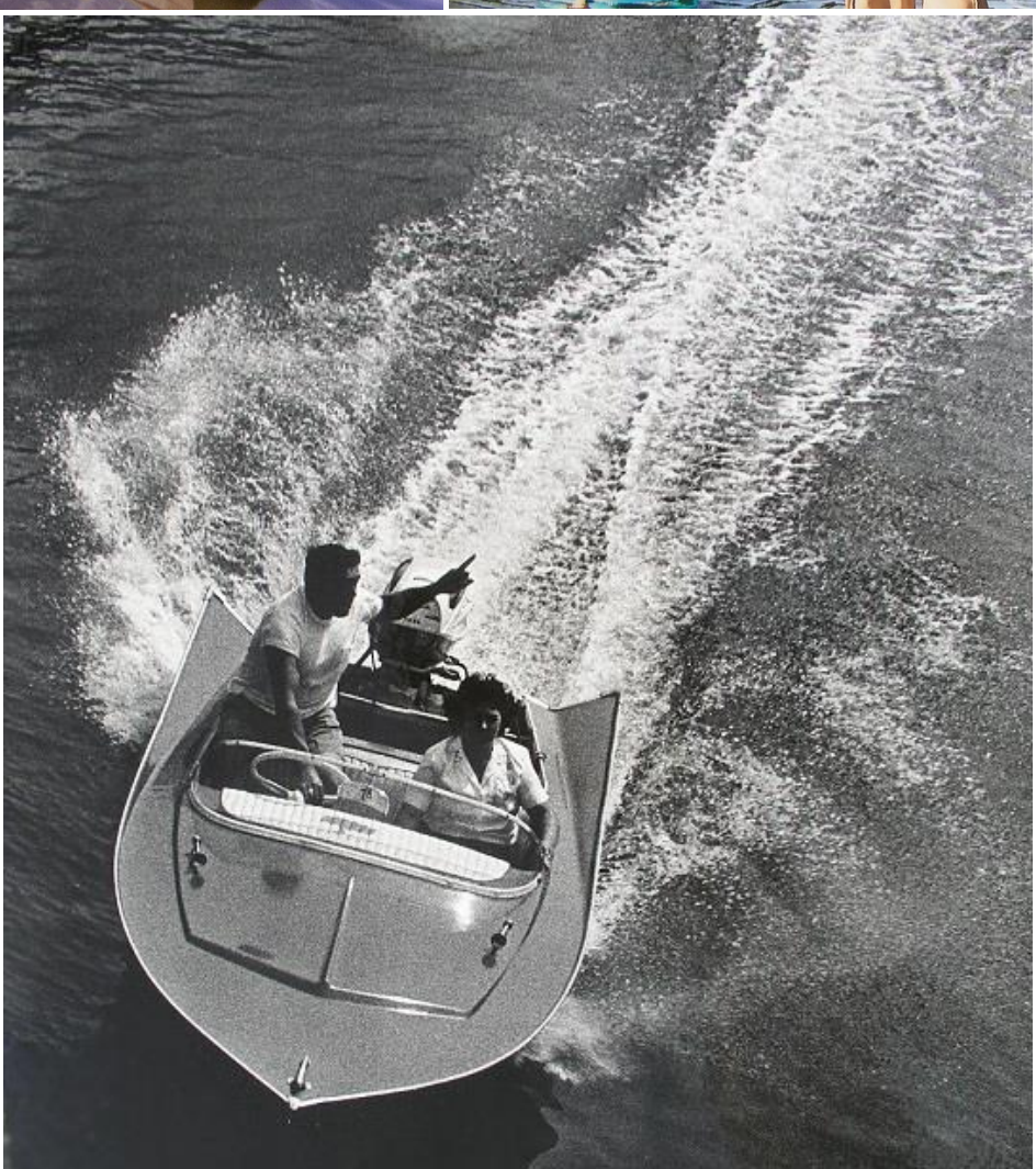
Couple operating speed-boat on Milwaukee River at West Silver Spring Drive in Glandale, WI enjoying the late days of summer (Labor Day) "circa late 1960's"