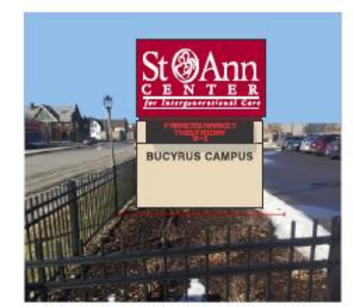
Projected Monument Sign - NTS - Final Placement TBD

View from West North Avenue, looking northeast