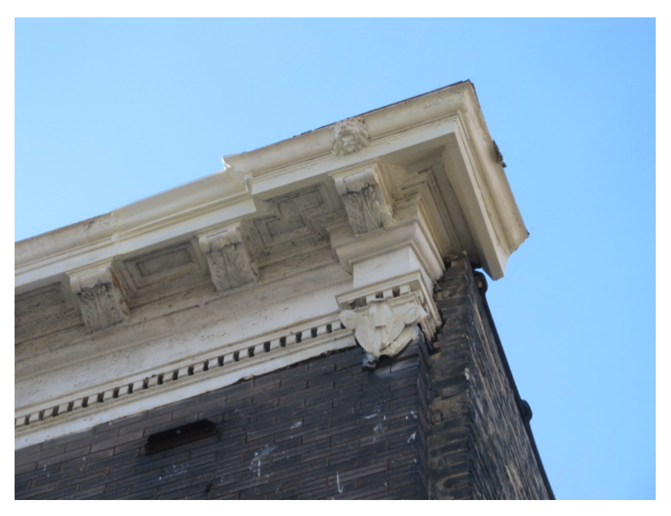
Upper Cornice – West End – repaired with formed sheet metal