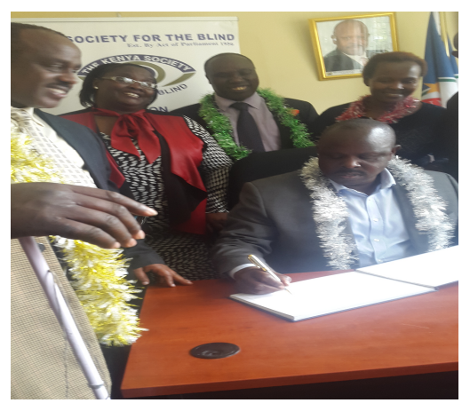
With Kenya Society for the Blind and Rotary Club

The County Government has improved access to clean and affordable water by reviving stalled community water projects, initiating new water infrastructure and improving of spring protections to expand water command area. However, much needs to be done in this sector and the City of Milwaukee will come in handy in mobilizing more resource for water infrastructure and water quality control and surveillance. Milwaukee water council will