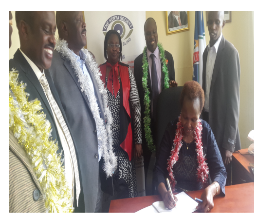
during the Signing of MOU with County Government of Bomet