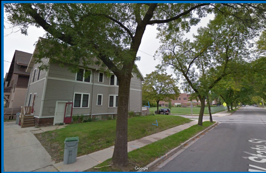
View from West State Street and 33 rd