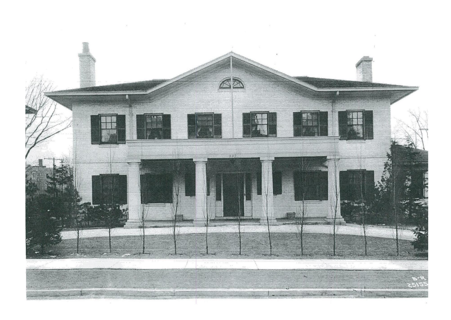
Photo from time of construction. The wood shutters have been in storage and will be painted and re-installed on the house.