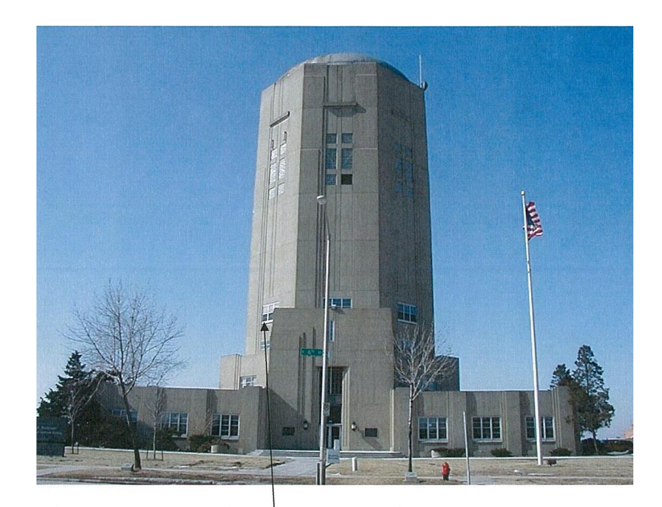
Fig. 1 EXISTING Elevation Looking West