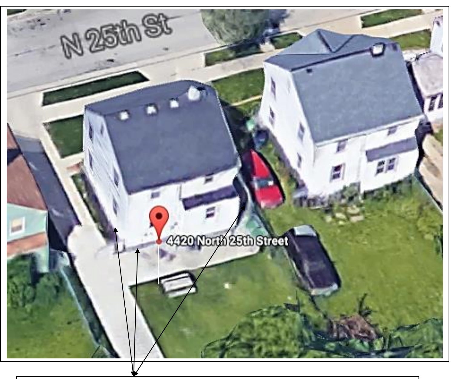
Furnace can vent at rear or along sides near the rear of the house.