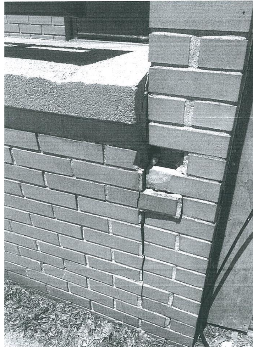
Close-up of existing condition. This entrance is not visible from Historic Mitchell Street