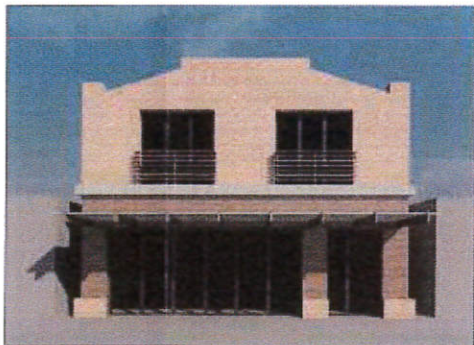
FACADE RENDERING NO SCALE