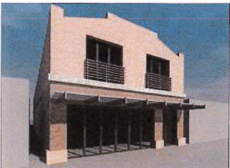
FACADE RENDERING NO SCALE