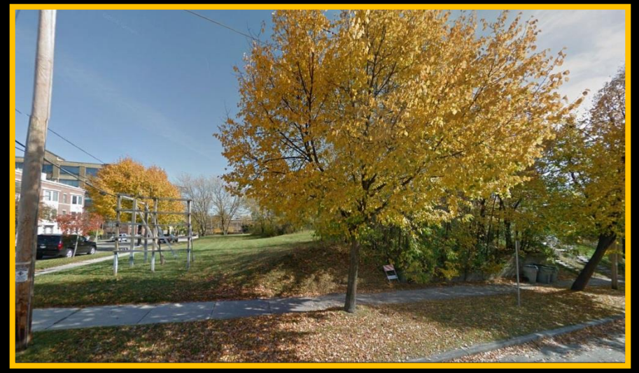
View from looking east from North Palmer Street