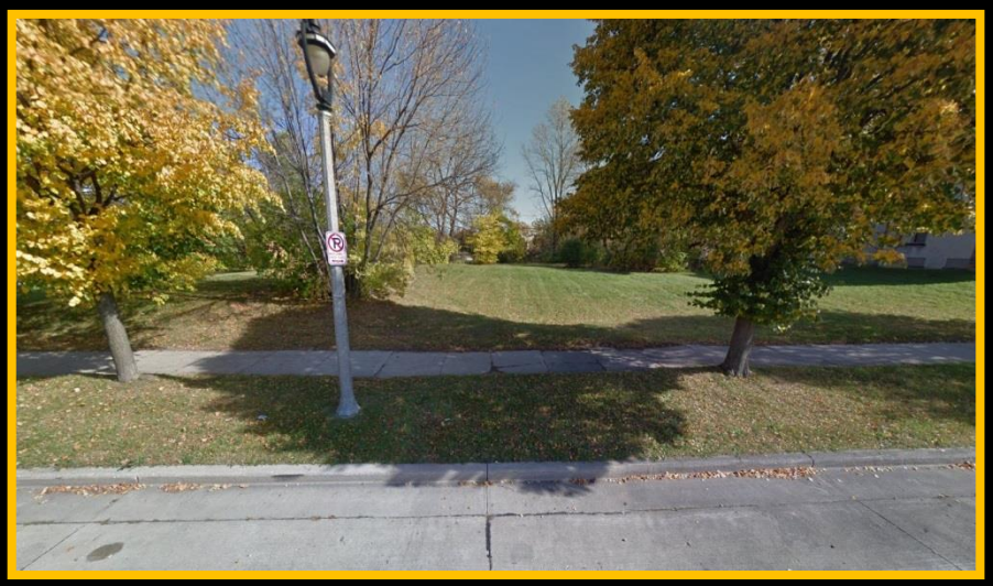
View from looking east from North Palmer Street