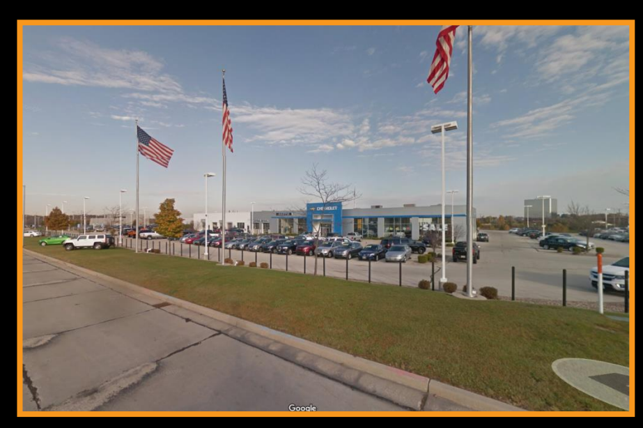
View from West Metro Auto Mall looking northwest