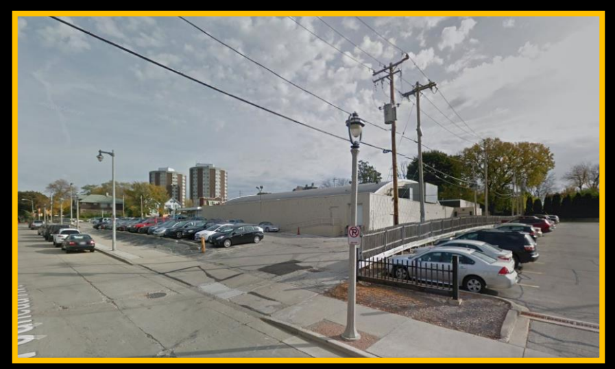
View from West Juneau Avenue, looking southeast