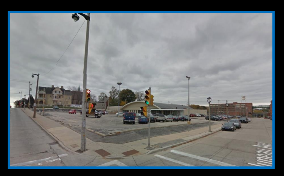
View from North 35th Street, looking southeast