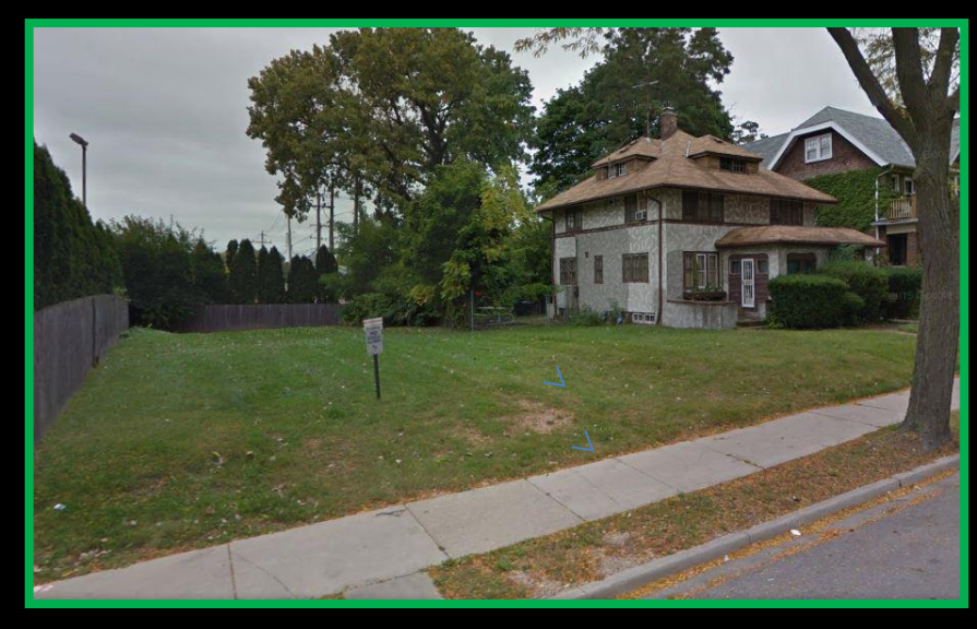
View from West Highland Boulevard, looking northeast