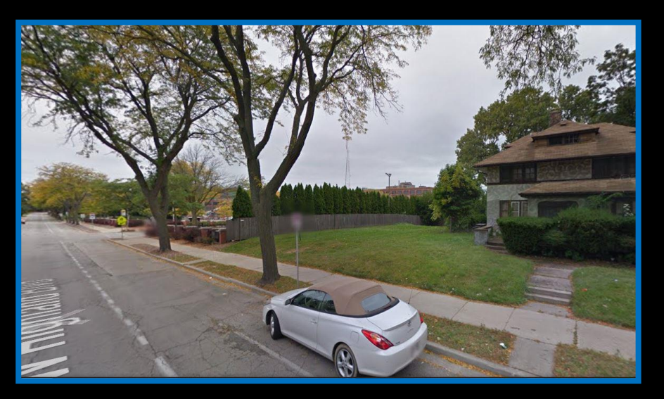
View from West Highland Boulevard, looking northwest