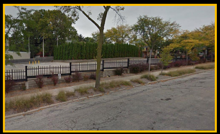
View from North 37<sup>th</sup> Street, looking across an existing parking lot