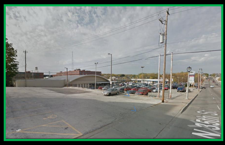
View from North 35th Street, looking northwest