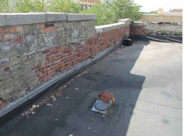
The east wall is in much better condition than the other parapet walls observed.