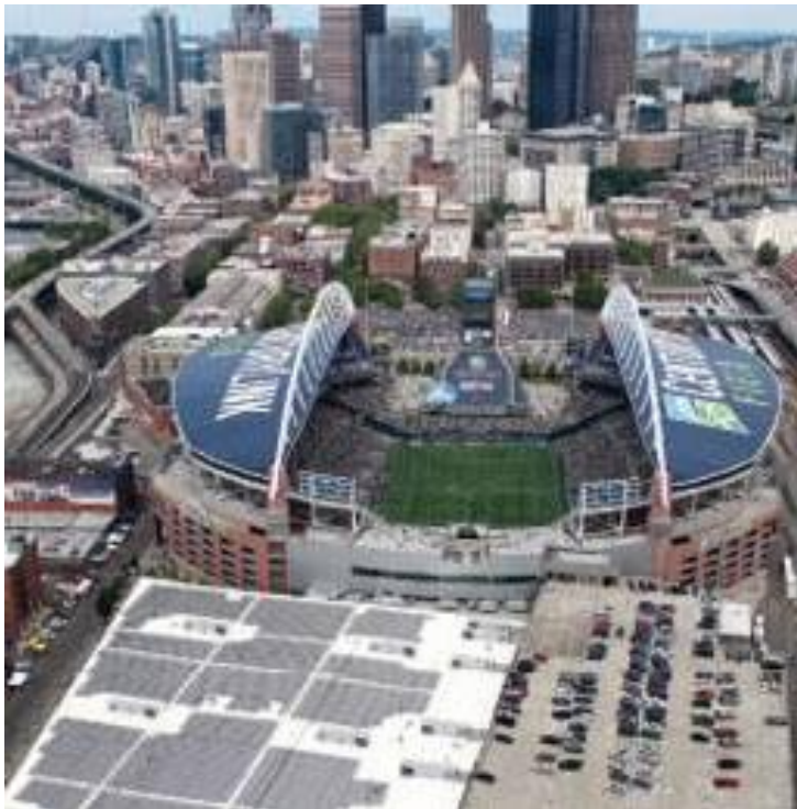
CenturyLink Field Seattle Seahawks, 2.5 acre site