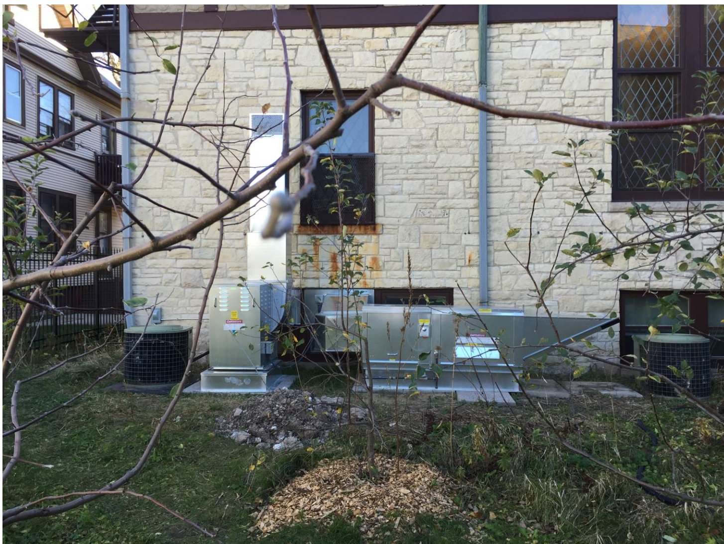
New venting as installed