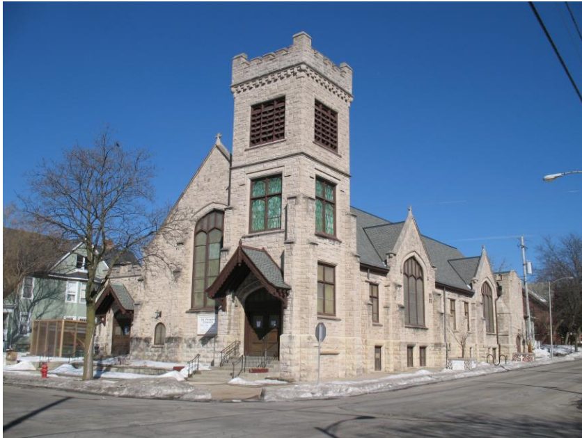
All People's Gathering Lutheran Church