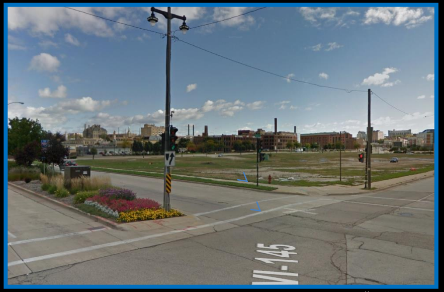
View from West Juneau Avenue and North 6<sup>th</sup> Street