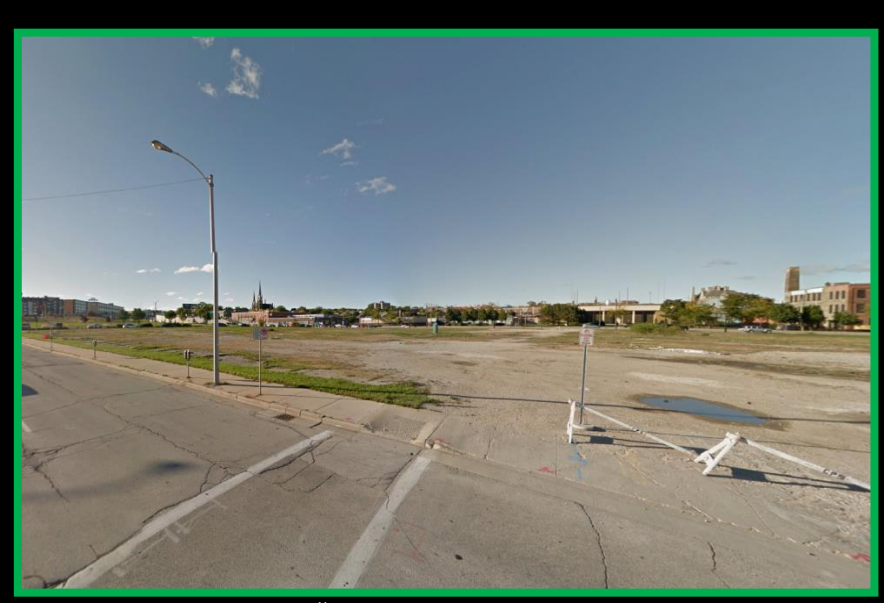
View from North 5th Street and West Juneau Avenue