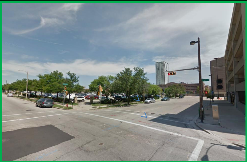
View from North 6 th Street and West Highland Avenue