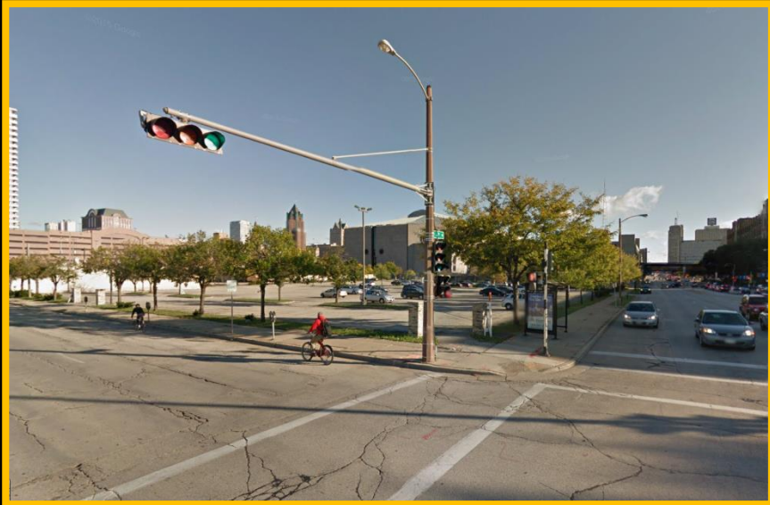
View from North 6 th street and West Juneau Avenue