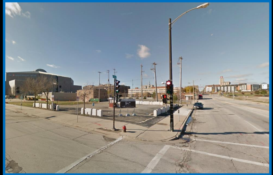
View from West Juneau Avenue and North 4 th Street