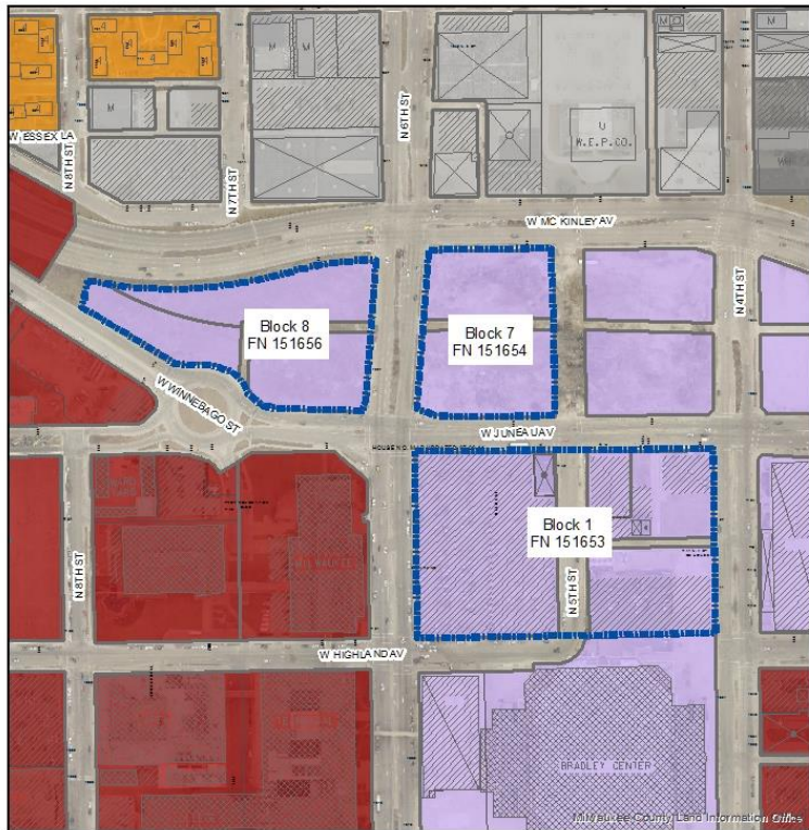
FNs 151653, 151654 and 151656 Arena Master Plan DPDs - Blocks 1, 7 and 8 April 2016

File No. 151653. A substitute ordinance relating to the change in zoning from General Planned Development to a Detailed Planned Development known as Block 1 -Arena Master Plan for construction of an arena on land located on the south side of West Juneau Avenue, west of North 4 th Street, in the 4 th Aldermanic District.