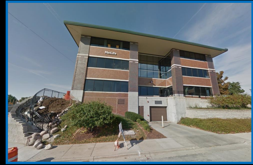
View from Honey Creek Corporate Center, looking west