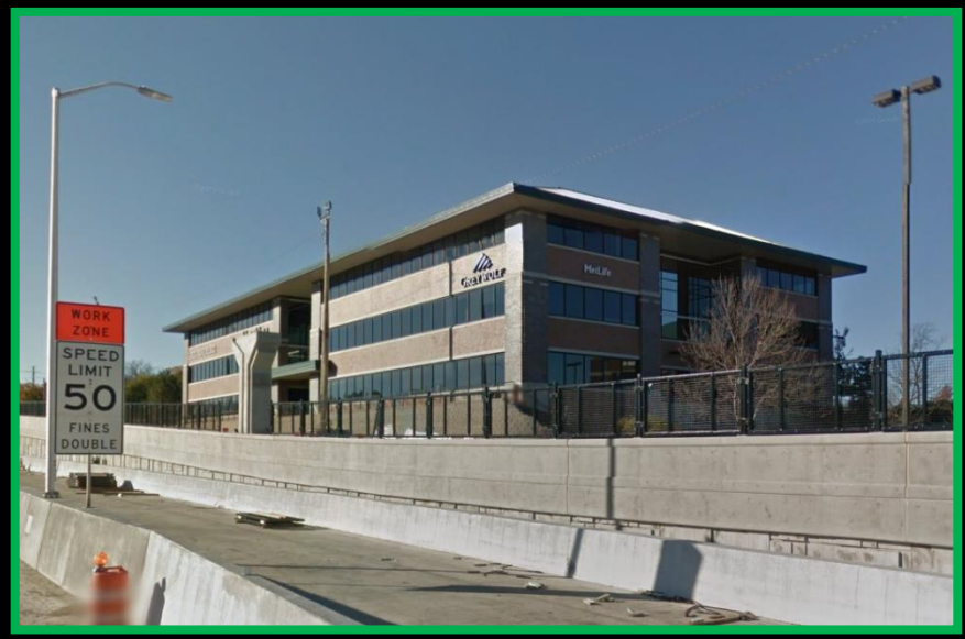
View from Interstate 94, looking northwest