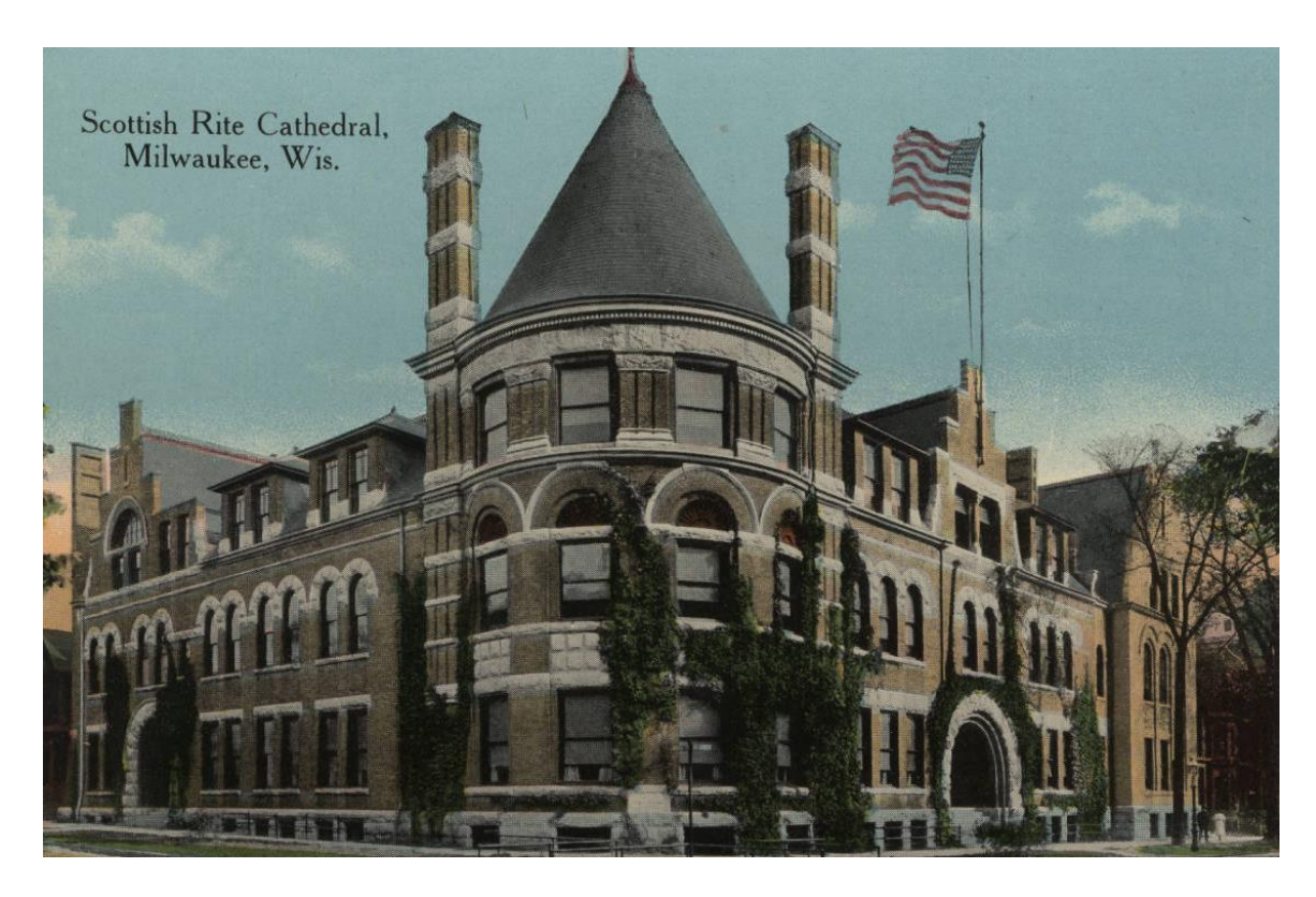
Postcard View after 1912 and before 1937. The 1912 addition shows at the far right.