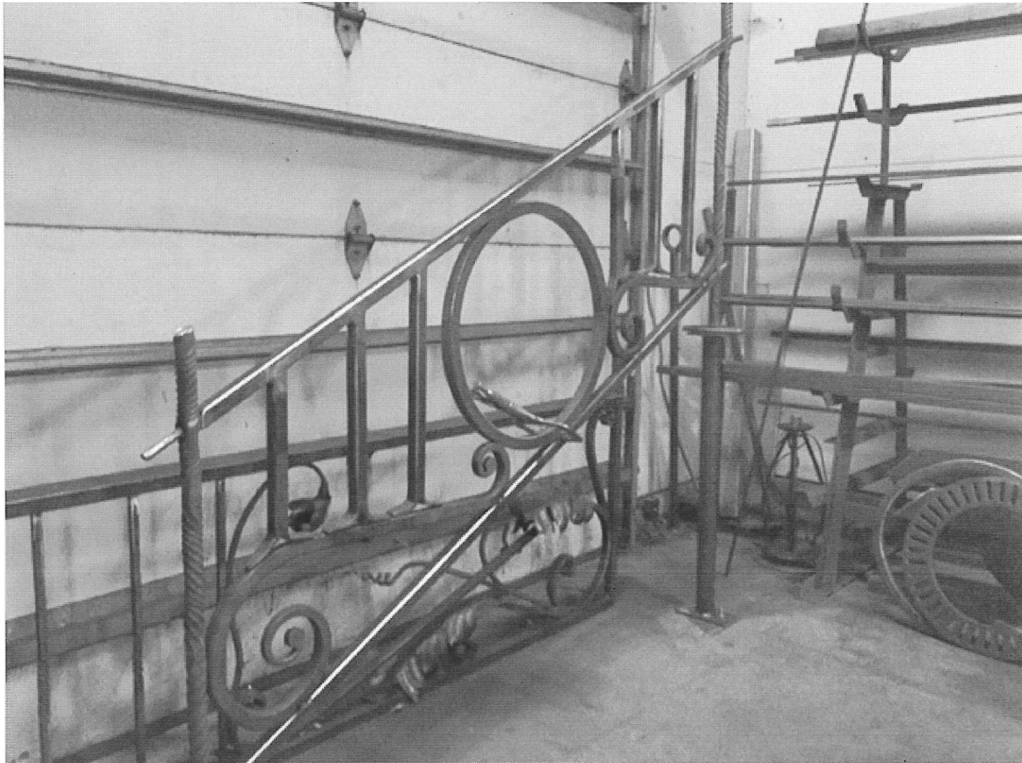
Railing partially completed