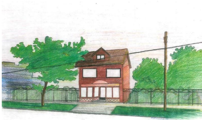
PROPERTY AFTER REHABILITATION