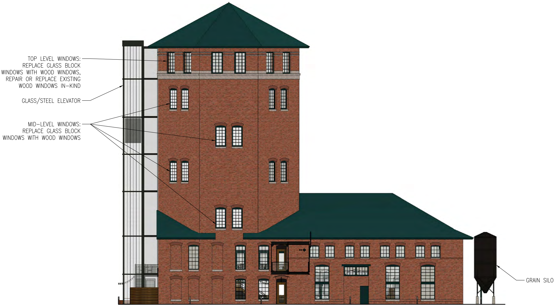
6 TOWER - NORTH ELEVATION 1/16"=1'-0" 150825_A3-01