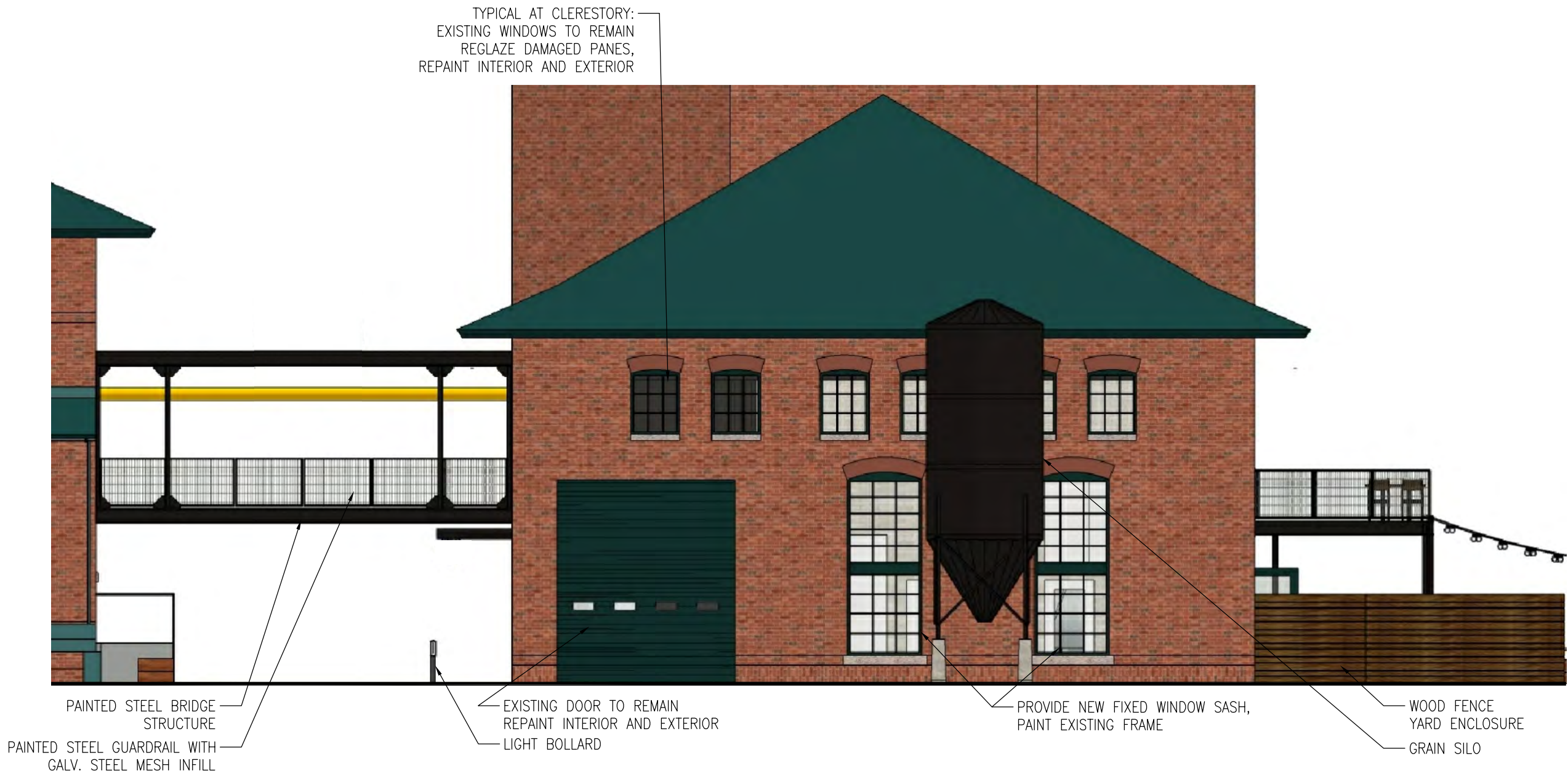
2 TOWER - PARTIAL WEST ELEVATION 1/8"=1'-0" 150825_A3-01