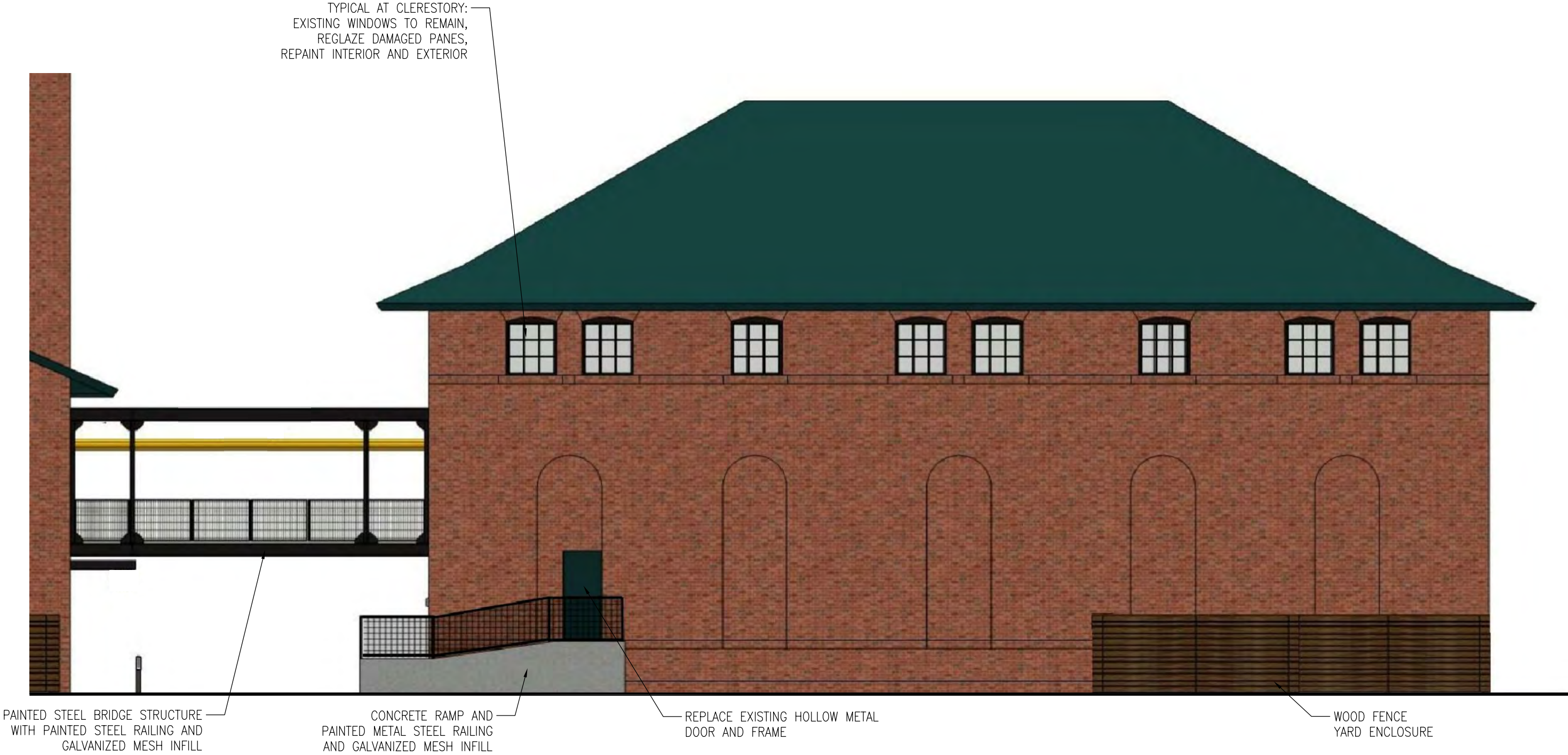
9 CONDENSER BLDG. - PARTIAL EAST ELEVATION 1/8"=1'-0" 150825_A3-01