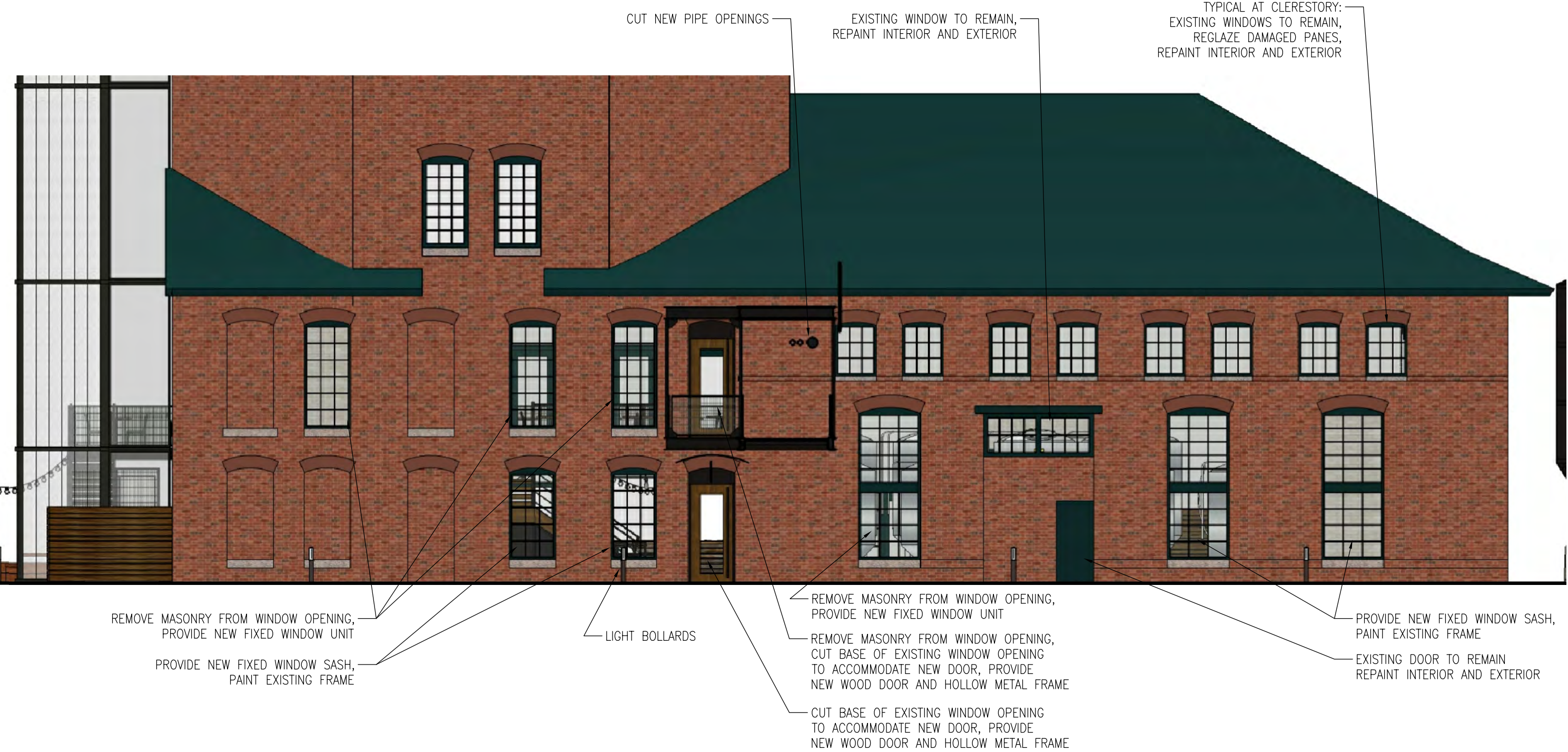
3 TOWER - PARTIAL NORTH ELEVATION 1/8"=1'-0" 150825_A3-01