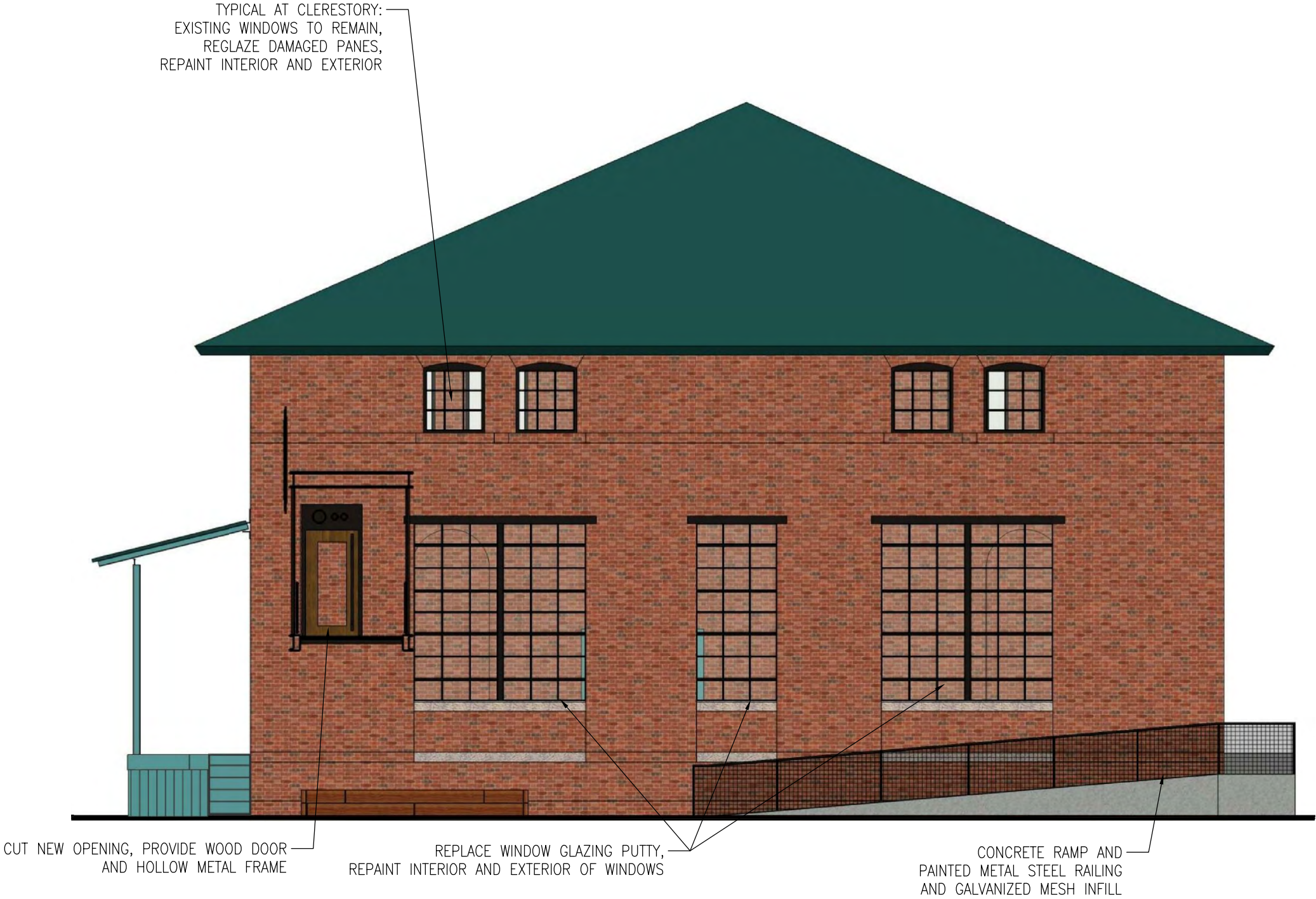
10 CONDENSER BLDG. - PARTIAL SOUTH ELEVATION 1/8"=1'-0" 150825_A3-01