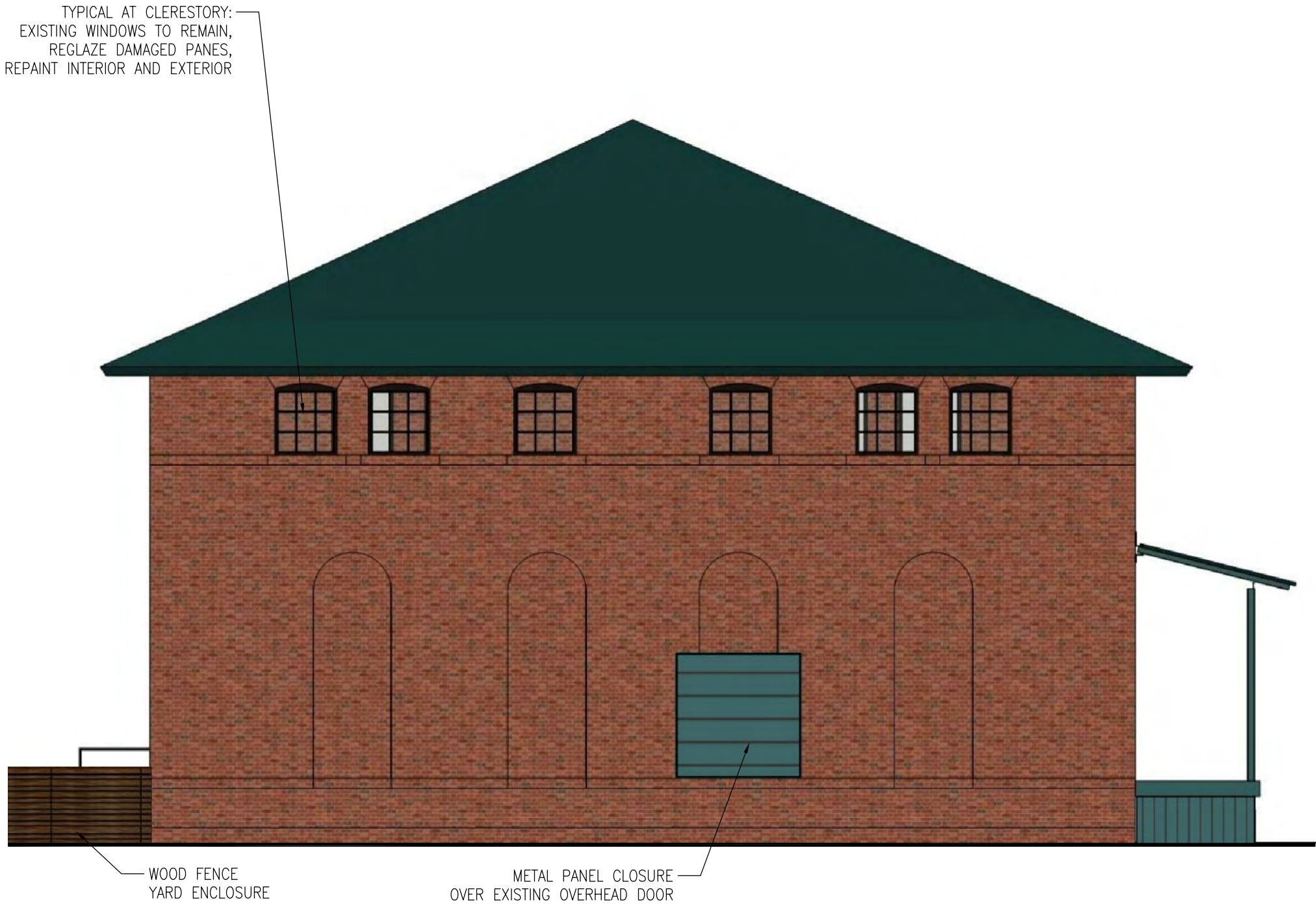
8 CONDENSER BLDG. - PARTIAL NORTH ELEVATION 1/8"=1'-0" 150825_A3-01