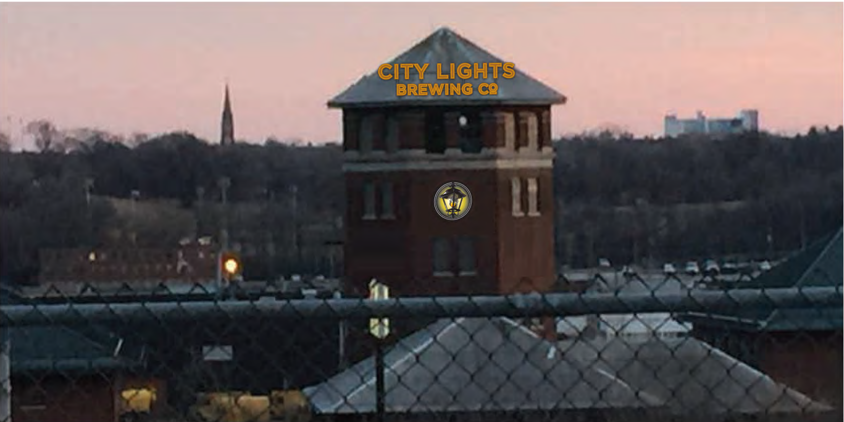
proposed layout [NORTH] - approx. size & location

Material: Aluminum Structure Color: Paint to match building roof [TBD]