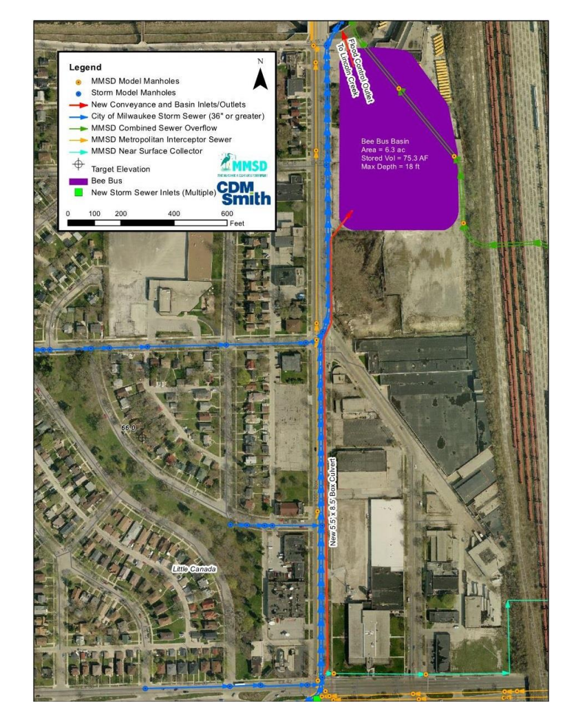
Conceptual Site Layout

Approximately 1.88 acres located in the 30<sup>th</sup> street Corridor at 4250 North 35<sup>th</sup> Street. The site will be assembled with an additional 6 acres to the north, already owned by MMSD, and developed as a stormwater detention basin. The estimated project cost is $31 million and is part of a larger stormwater management system for the area, with plans to complete the work by winter of 2016.