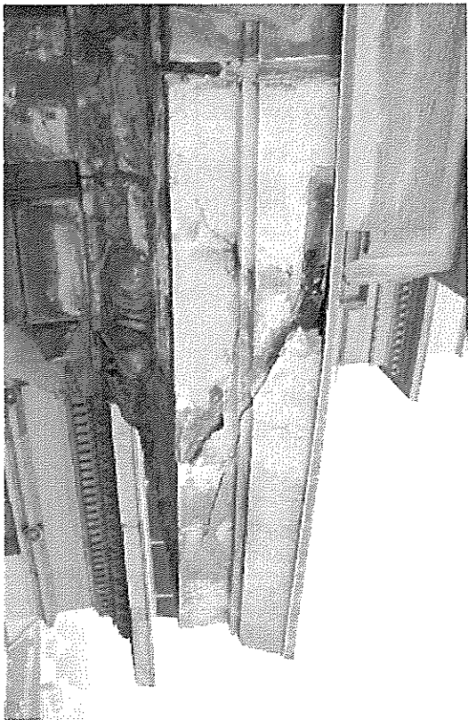
Sample conditions showing stone that will be replaced and typical copper flashing conditions.