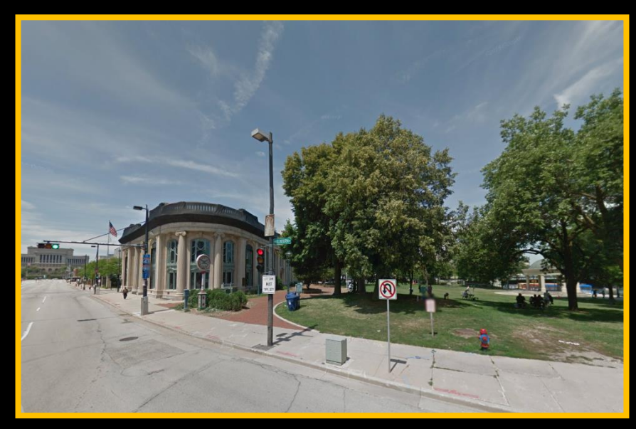
View from West Kilbourn Avenue, looking northwest