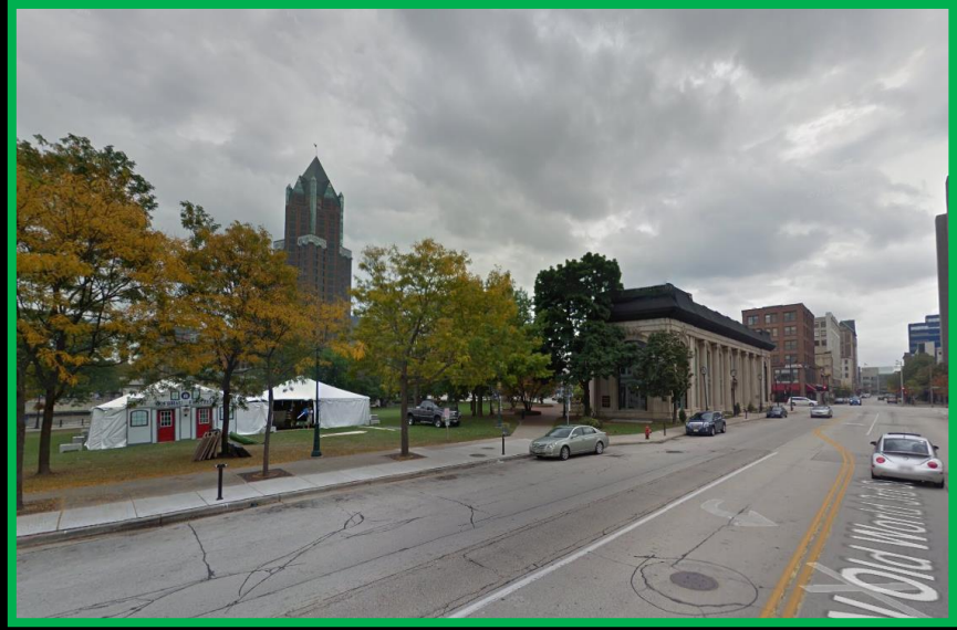
View from North Old World 3<sup>rd</sup> Street, looking southeast