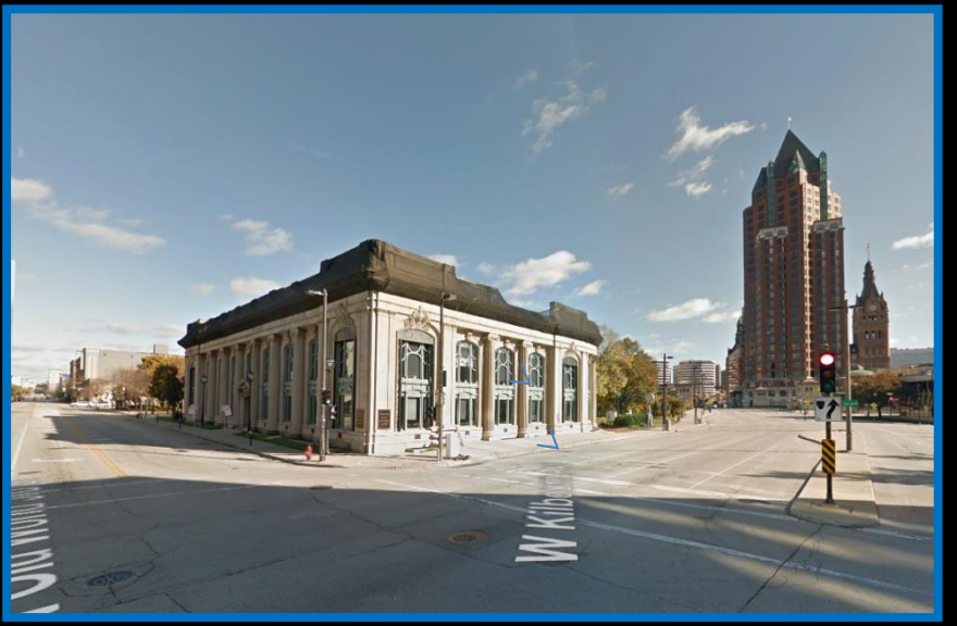
View from West Kilbourn Avenue and North Old World 3<sup>rd</sup> Street