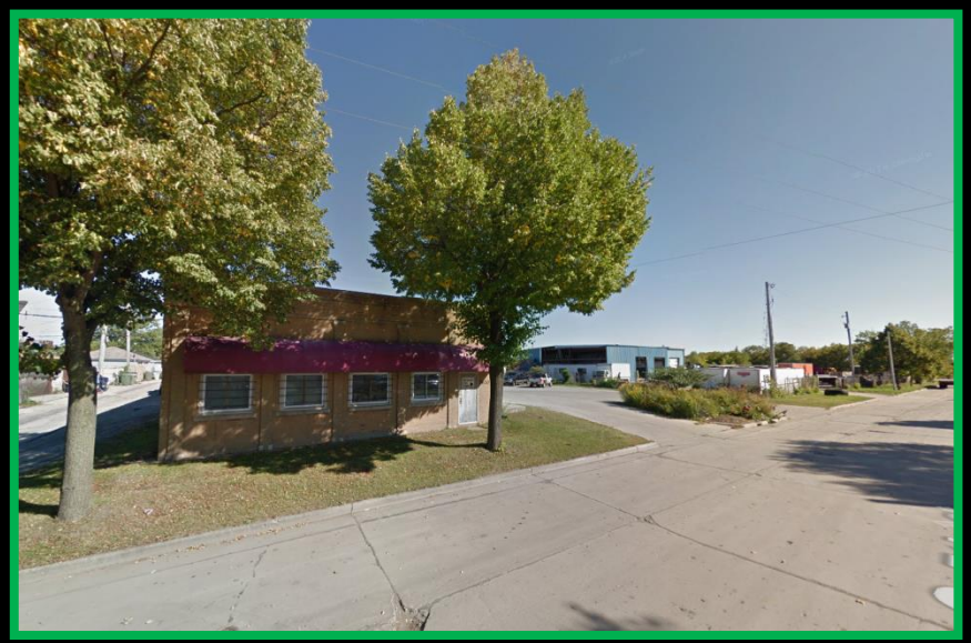
View from South 5<sup>th</sup> Street, looking southeast