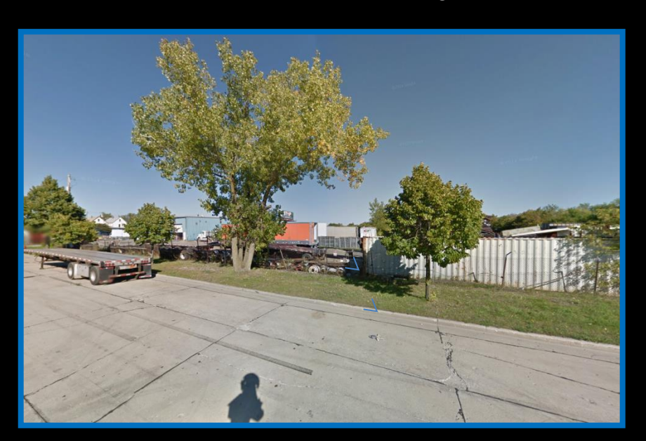
View from South 5^{\text{th}} Street, looking northeast