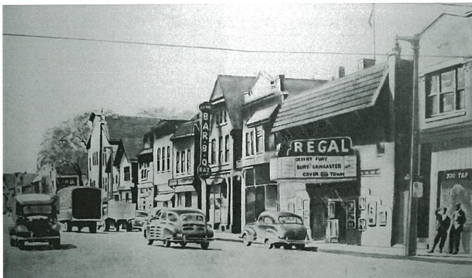
Old Walnut Street - charcoal drawing by Sylvester Sims, based on a photograph taken in 1947.

As we prepare to share Welcome to Bronzeville , the final play in the series, we are seeking partners to help us make this production a true community celebration through gatherings, discussions, art exhibits, shared meals and conversations, and more.