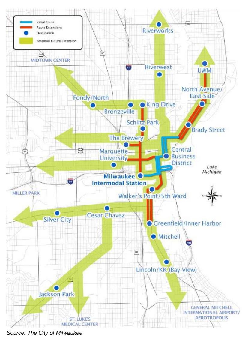
Figure 2: Potential Extensions of the Milwaukee Streetcar

temporarily affect the routing of MCTS vehicles during construction, but should have minimal effect on MCTS vehicles once the Streetcar is in operation.