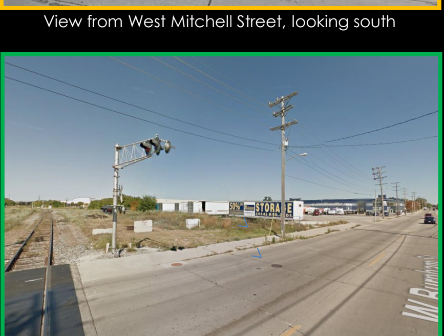
View from West Burnham, looking northeast