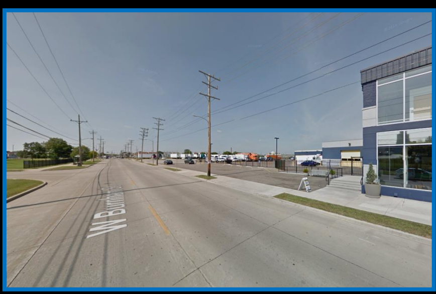
View from West Burnham, looking northwes