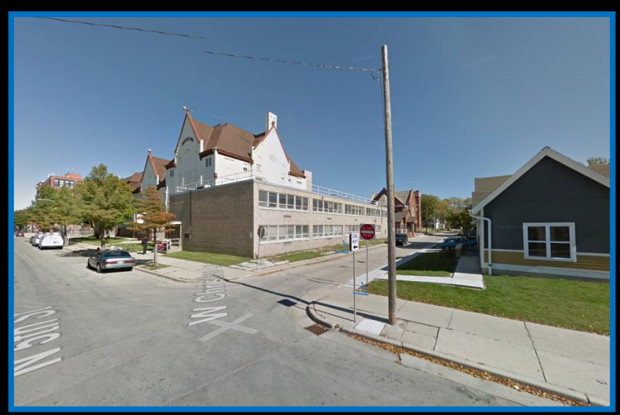
View from North 5<sup>th</sup> Street and West Christine Lane