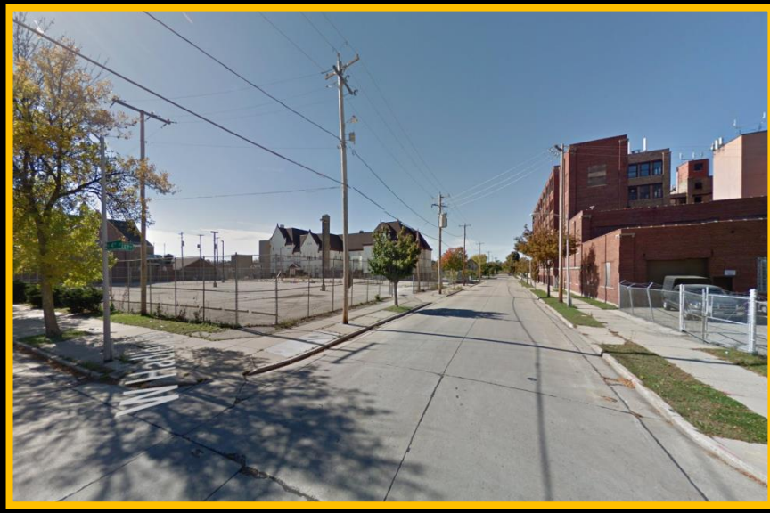
View from North 4th Street and West Hadley Street