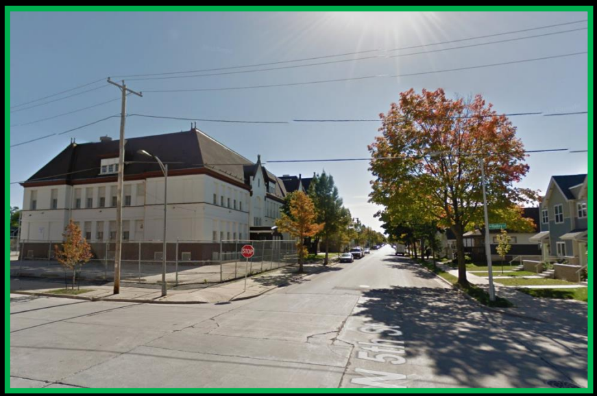
View from North 5<sup>th</sup> Street and West Hadley Street