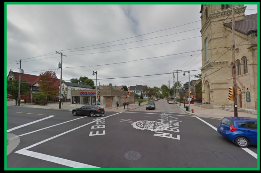
View from East Brady Street and North Humboldt Avenue