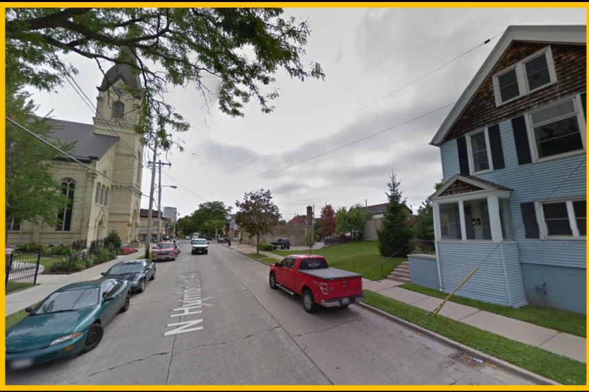
View from North Humboldt Avenue, looking southwest