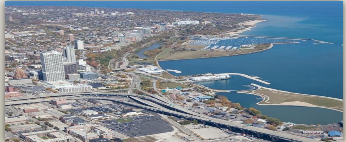
Milwaukee Gateway Project