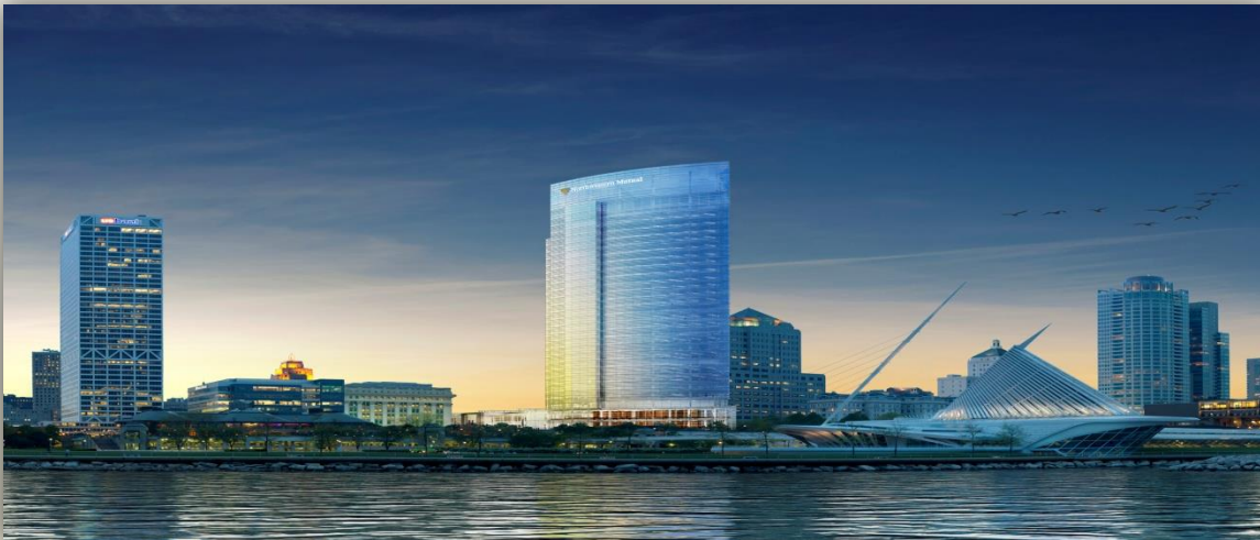
Northwestern Mutual Building