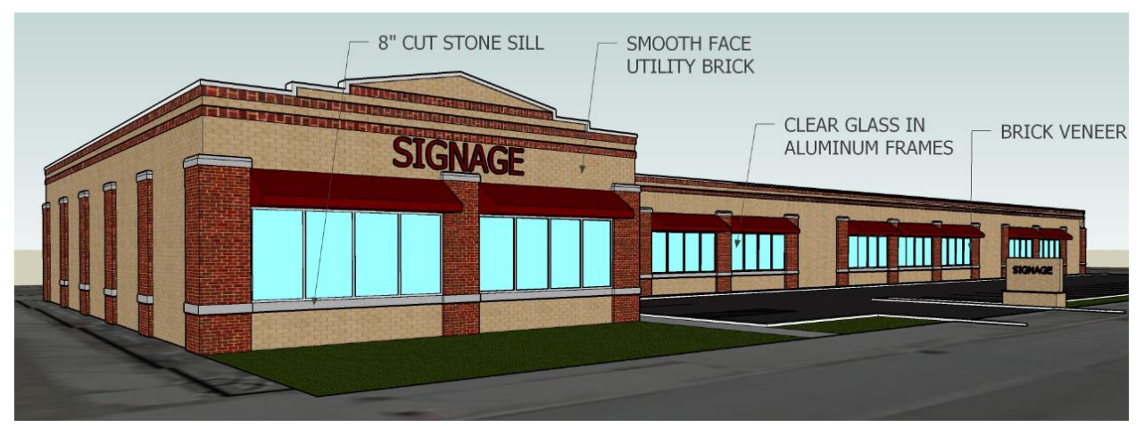
4616 West Hampton Southwest View

The Buyer intends to install new landscaping along the street frontages that will meet the intent of the Milwaukee Code of Ordinances Section 295-405, Type B (Milwaukee Zoning Code-Landscaping).