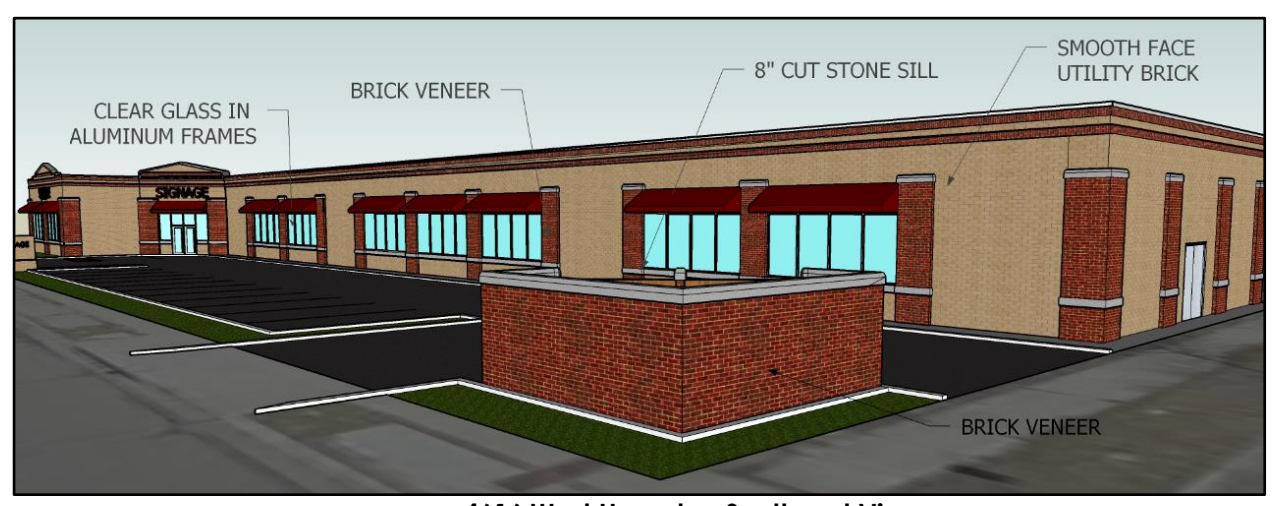
4616 West Hampton Southeast View