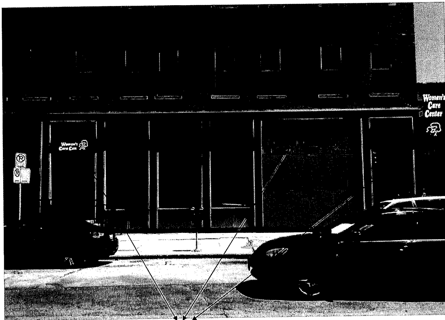
South 7 th Street elevation. Signage on wall, at entrance, at corner.