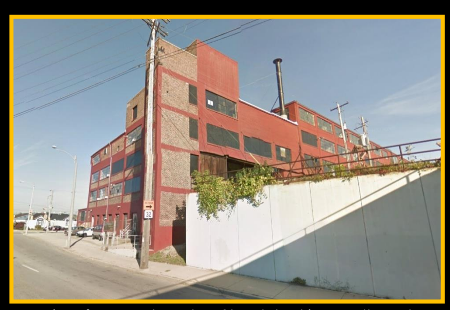
View from East Becher Street, looking northwest