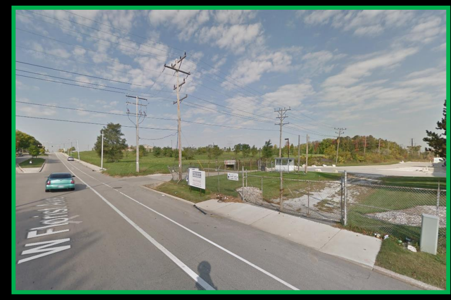
View from West Florist Avenue, looking northwest