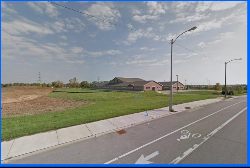
View from West Florist Avenue, looking northeast