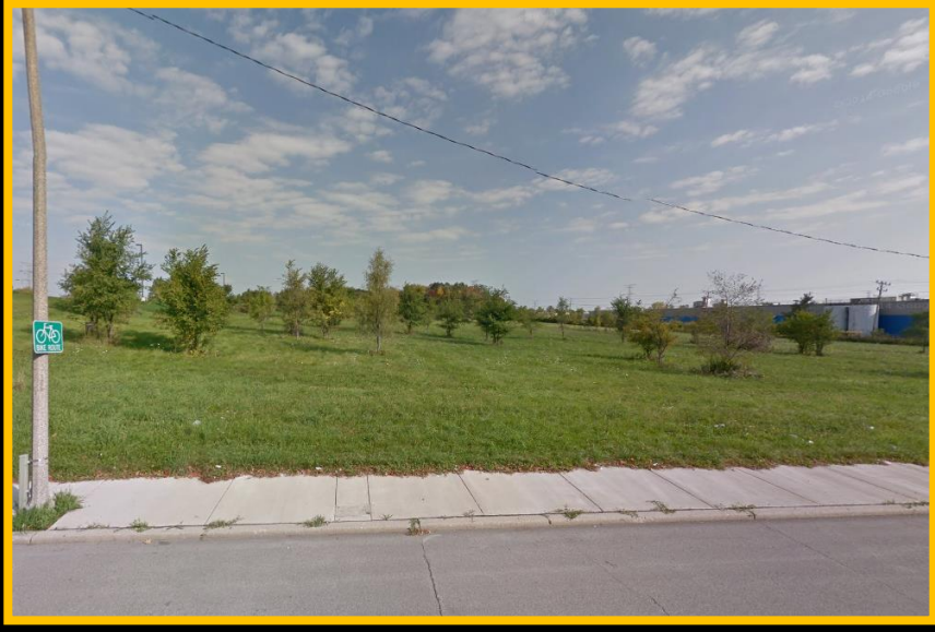
View from West Florist Avenue, looking north