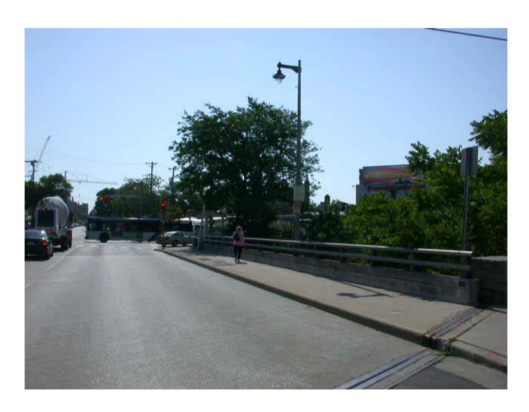
Figure 2: View from Eastbound E. North Avenue Approaching N. Oakland Avenue