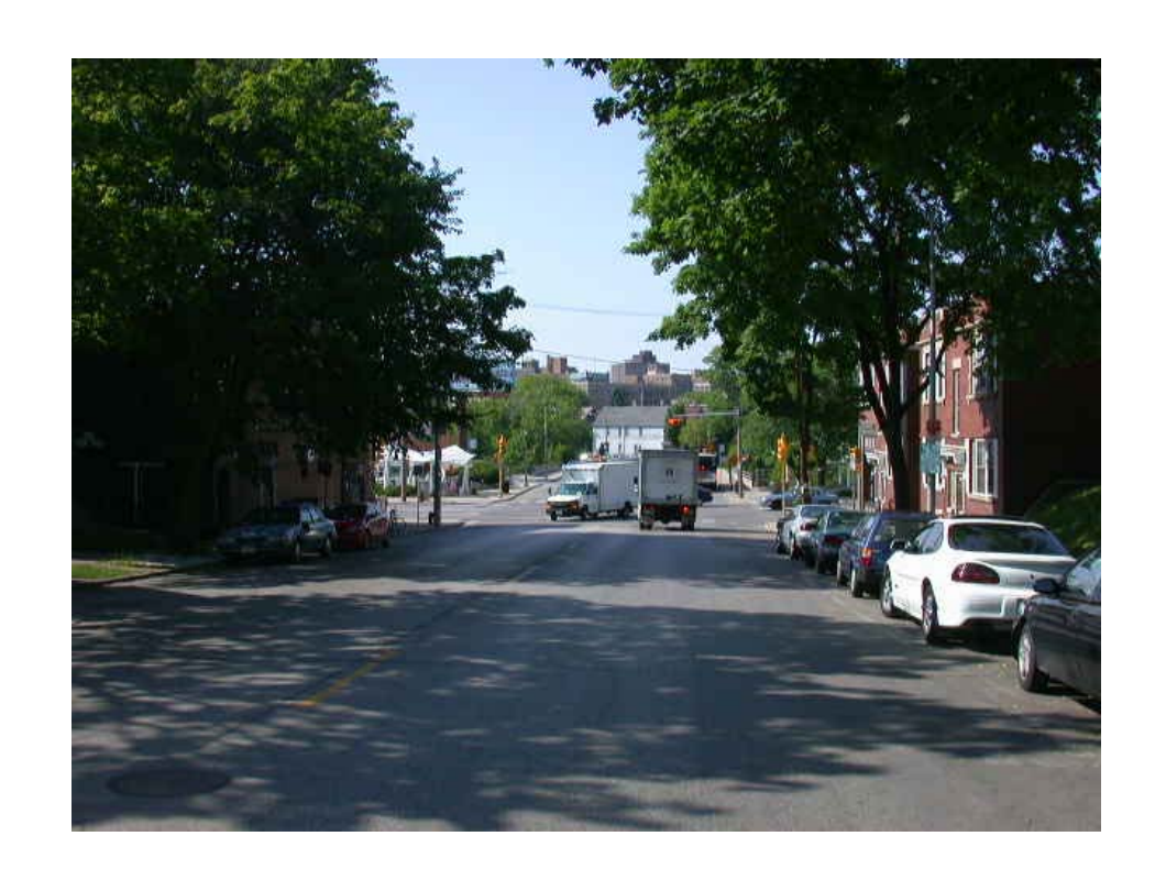
Figure 3: View from Southbound N. Oakland Avenue Approaching E. North Avenue