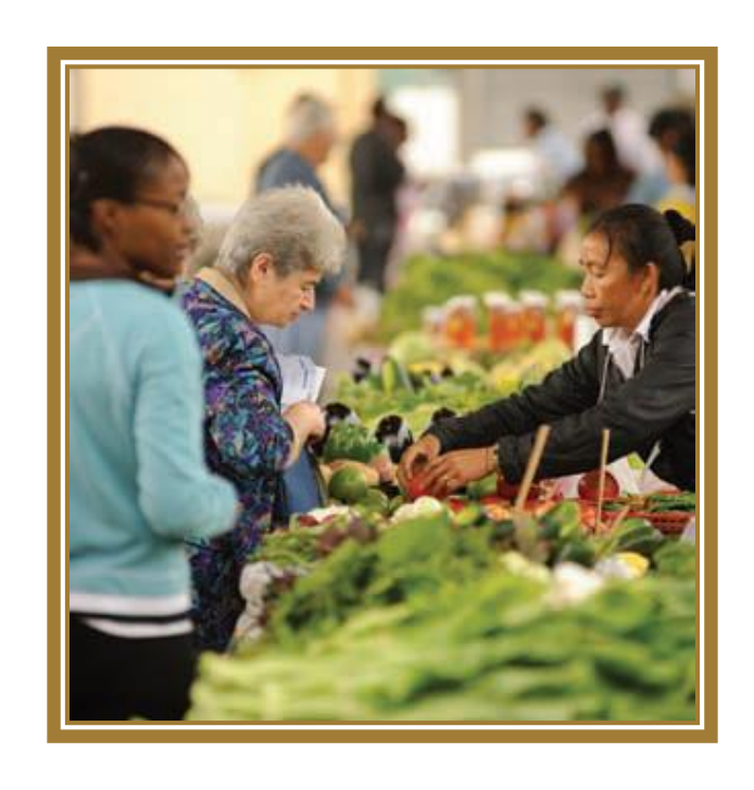
$54.0 million in tax base returned