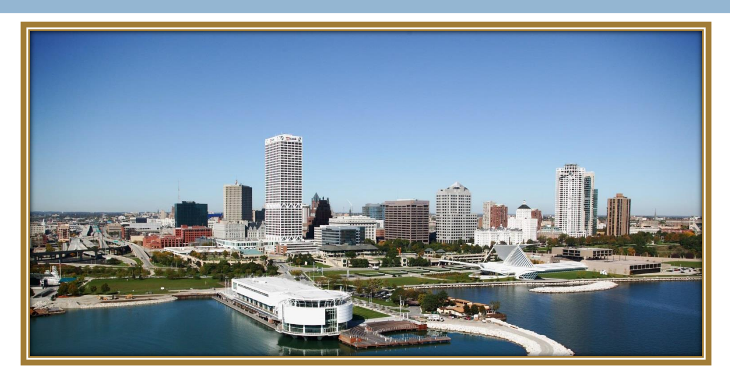
2014 Annual Report Expenditures & Activity through December 31, 2014 Department of City Development