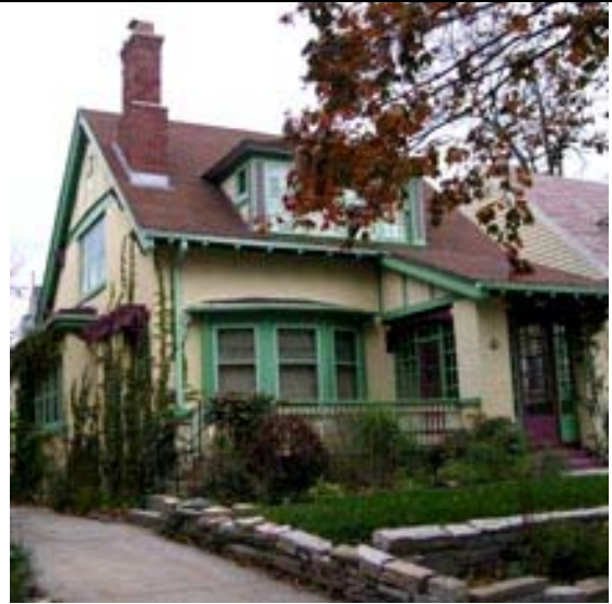
2009 East Kenwood Boulevard