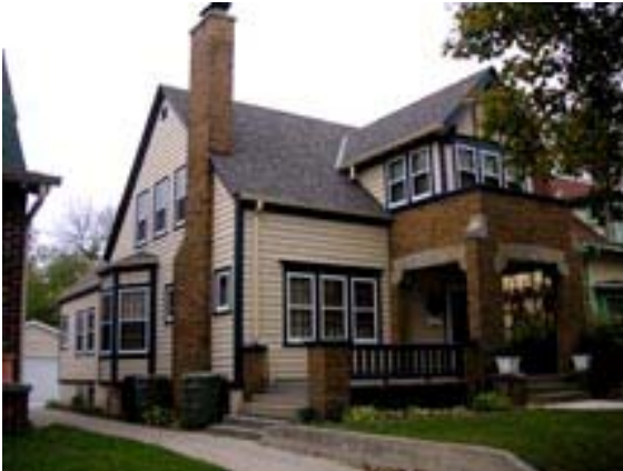
2015 East Kenwood Boulevard