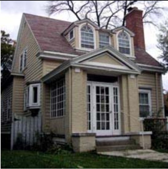
2005 East Kenwood Boulevard