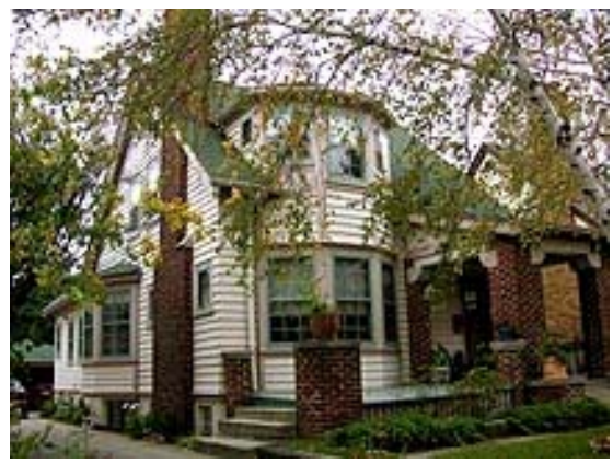
2019 East Kenwood Boulevard