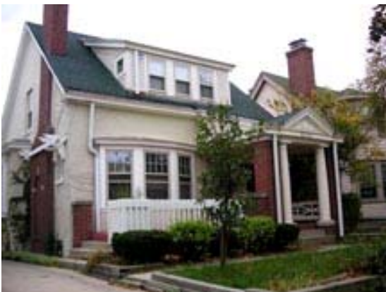
2025-27 East Kenwood Boulevard