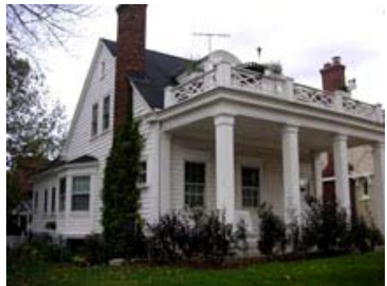
2029 East Kenwood Boulevard