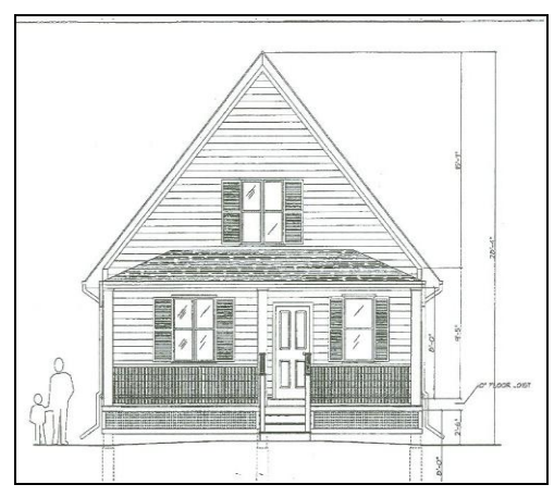
Preliminary Front Elevation